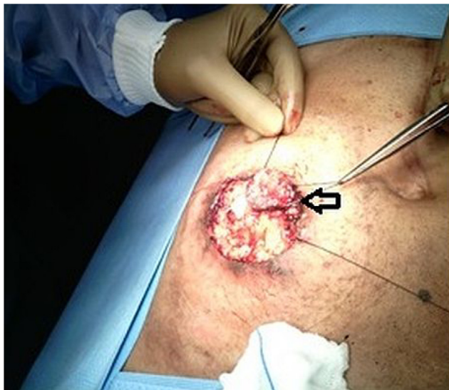
Fig. 1 – Intraoperative ileostomy site with the lesion (black arrow) in the superomedial mucocutaneous junction which is dissected and mobilized.

Before stoma closure CT scan had shown normal distal bowel and no evidence of recurrence. Three months prior to the closure; patient had reported oozing of blood from the stomal site. A local examination revealed an area of hypergranulation which was attributed to chronic irritation and was left alone.