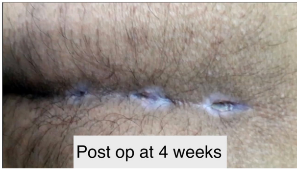
Fig. 3 – Post operative after 4 weeks.