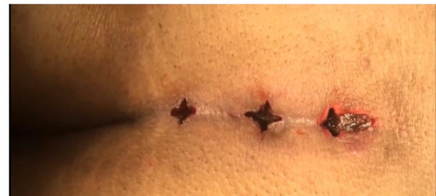
Immediately after Laser Pilonidotomy