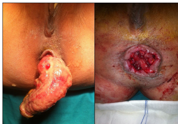
Fig. 1 – On the tenth day after the initial surgery, the exteriorized segment was amputated, and delayed coloanal anastomosis was performed.

A 55 year-old woman presented to our clinic with a 2 week history of constipation and rectal bleeding. A digital rectal examination revealed an irregular mass in the anal canal located 3 cm from the anal verge. The only significant aspect of the patient's prior medical history was hypertension.