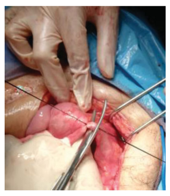
Figure 4 Intestinal fistula.

The biopsy of the extracted piece revealed an moderately differentiated infiltrating ulcerated adenocarcinoma with neuroendocrine features resulting from a transverse colostomy in the loop, resection borders free of neoplasia, 41