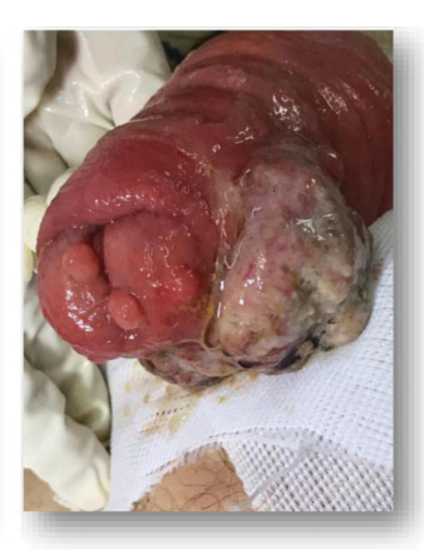
Figures 2 and 3 Prolapsed ostomy with presence of tumor lesion.

( >Figs. 2 and 3 ), in addition to an infraumbilical midline eventration of 5 \times 4 cm, without inguinal lymphadenopathy. At the proctological level, we found anal margin without lesions; the digital rectal examination found that the sphincter retained tone, good puborectal muscle response, no palpable lesions, and anoscopy without alteration.