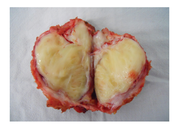
Fig. 3 - Desmoid tumor of the abdominal wall.

Proctocolectomy with J-pouch ileoanal anastomosis is the gold standard treatment for FAP and was performed in 18 (24%) of the patients. This procedure is typically recommended when there are many polyps in the rectum or in patients with severe genotype (i.e. mutations between codons 1250 and 1464). <sup>20,24,25</sup> Young women considering pregnancy should avoid or postpone RCP as fertility may be reduced as reported in some studies, <sup>26</sup> although a more recent one found no association with the type of operation. <sup>27</sup> Early and late complications rates in our patients were 38.9% and 27.8%. Anastomotic dehiscence was the most common cause of morbidity (71.4%). Mortality rate was 5.5%.