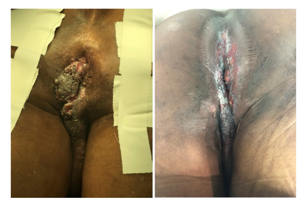
Fig. 4 - Squamous cell carcinoma of the anus at diagnosis and after radiotherapy and chemotherapy.