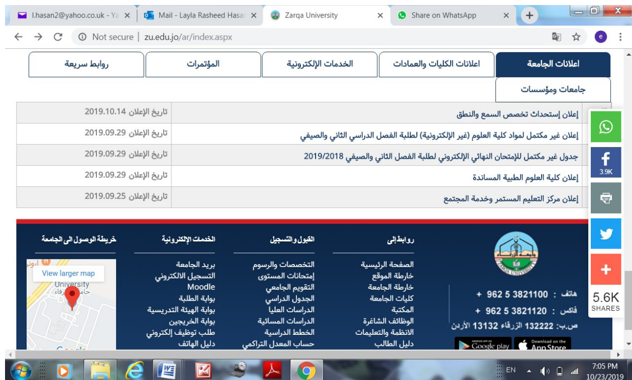
Figure 1: The home page of Zarqa University where the Moodle link is located at the bottom of the page in a small font size.

The location of the login links on the home page of Moodle was not obvious: one was located at the top of the home page of Moodle but it was written using a small font size; the other was located in the middle of the page instead of at the top.