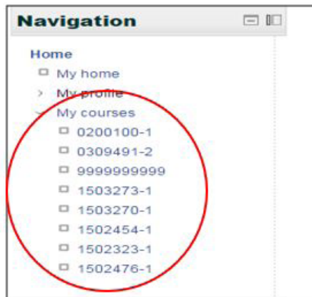
Figure 2: The courses on the navigation menu are displayed by their numbers and not by their names

Ease of use, speed and internal search function: The results showed that Group one of the students identified four common usability problems related to this category; three of them were identified on the two interfaces of Moodle while one of them was identified only on the mobile/tablet interface of Moodle, as shown in Table 3. Only one of the four identified usability problems related to this area is a general problem in Moodle LMS. This is that it is not easy to submit an assignment. The other three usability problems related to this area are specific to the interfaces of the local instance of Moodle LMS that was used by the university where the study took place. The Likert scores obtained from Group two of the students confirmed two out of the four identified usability problems. These related to: