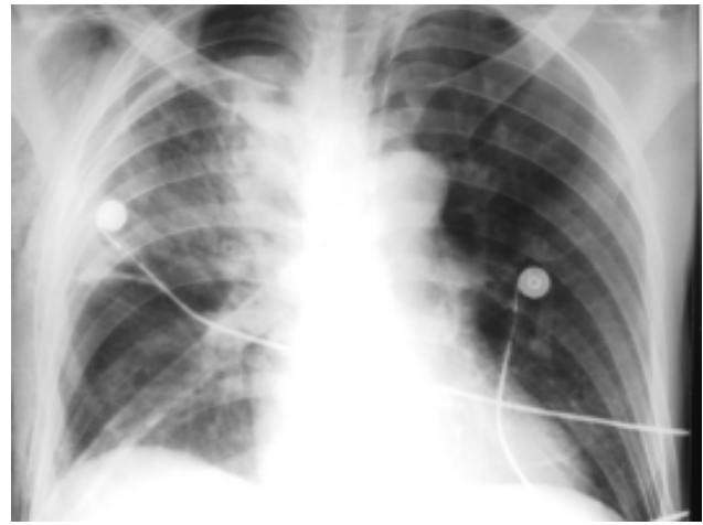
Figure 2 – Right spontaneous hypertensive pneumothorax with evolution longer than 48 h in a COPD patient. Approximately 12 h after the drainage, the patient presented clinical features compatible with acute pulmonary edema. At the control X-ray, the presence of unilateral reexpansion pulmonary edema is noticeable, with predominant opacity at the right upper lobe, air bronchogram and cissural and pleural effusion.