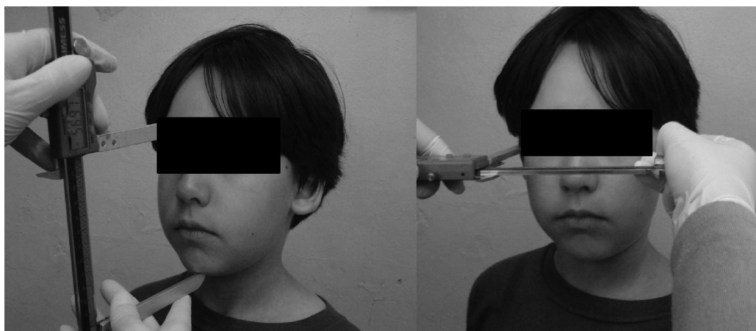
Figure 1. Anthropometric assessment to determine the facial type: height and width facial measurement

Additionally, the results obtained from association among the facial type and breathing mode/mouth breathing etiology are shown (Table 2). For statistical analysis purposes the