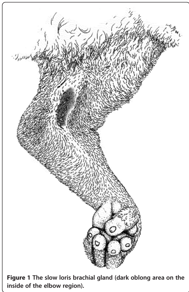
Figure 1 The slow loris brachial gland (dark oblong area on the inside of the elbow region).

Local beliefs only give us a starting point to search for the nature and function of slow loris venom. Alterman [8] was the first researcher to show with in vivo experiments that loris venom can actually kill other animals. In a set of experiments where he injected secretions from captive greater slow lorises ( N. coucang ) into mice, Alterman discovered that loris venom was only deadly when secretions from a loris' brachial gland (brachial gland exudates – BGE) were combined with saliva. Death rates of mice differed based on the extract used to dissolve the toxin. From this Alterman concluded that lorises may possess two toxin types: one fast-acting aqueous toxin and a second toxin that enters the