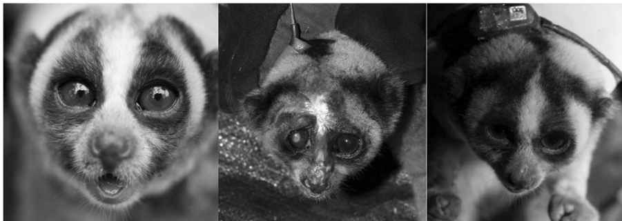
Figure 5 Male wild Nycticebus javanicus , from Cipaganti near Garut, Java, during three successive captures in April 2012, November 2012 and February 2013, showing his appearance before receiving a severe conspecific bite wound, just afterwards, and 3 months afterwards.

Still's [58] was the first anecdotal account of the uncanny resemblance of the slender loris ( Loris sp.) to a