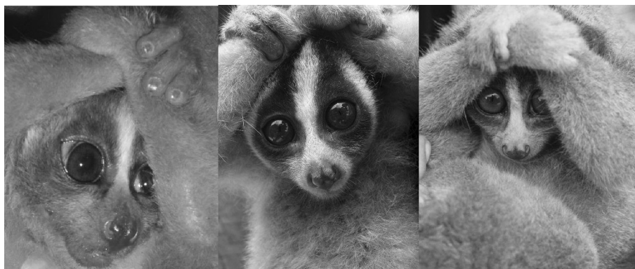
Figure 2 Slow lorises in defensive posture, whereby the arms are raised above the head to combine saliva with brachial gland exudate: N. menagensis , N. javanicus and N. coucang .

circulatory system more slowly, although he was not able to characterise this biochemically.