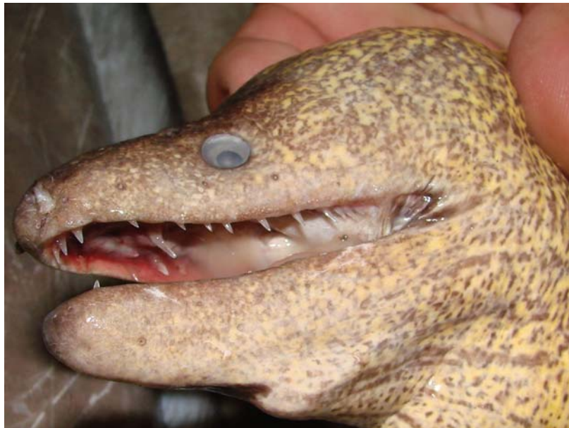
Figure 1. The largest and commonest moray eel in the Azores archipelago is Muraena helena . Note the sharp teeth, capable of to cause lacerations in the victim.

In this paper we report an unprovoked attack that caused a serious bite on the left hand of a free swimming spear fisherman.