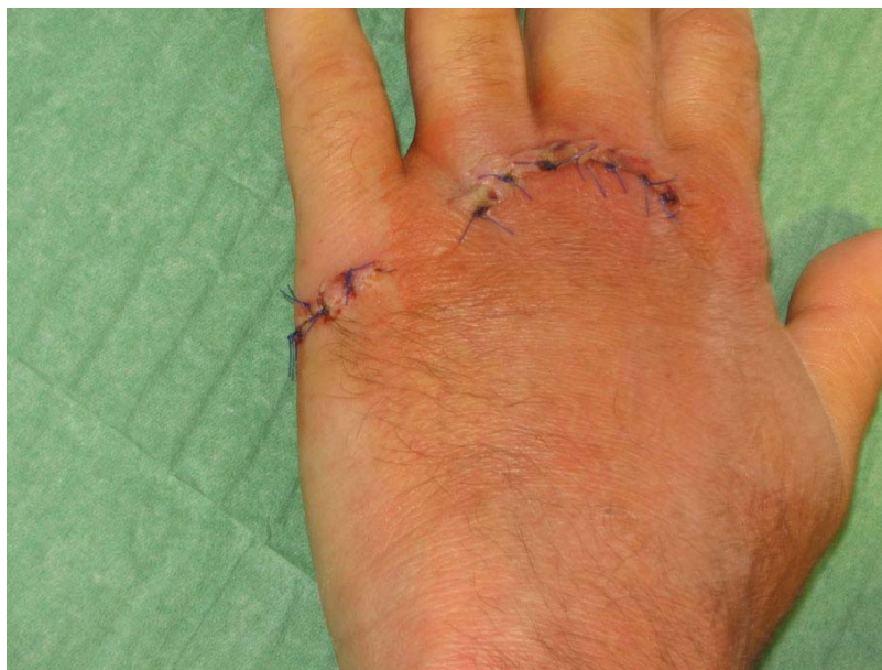
Figure 3. Evolution of the injury after ten days.