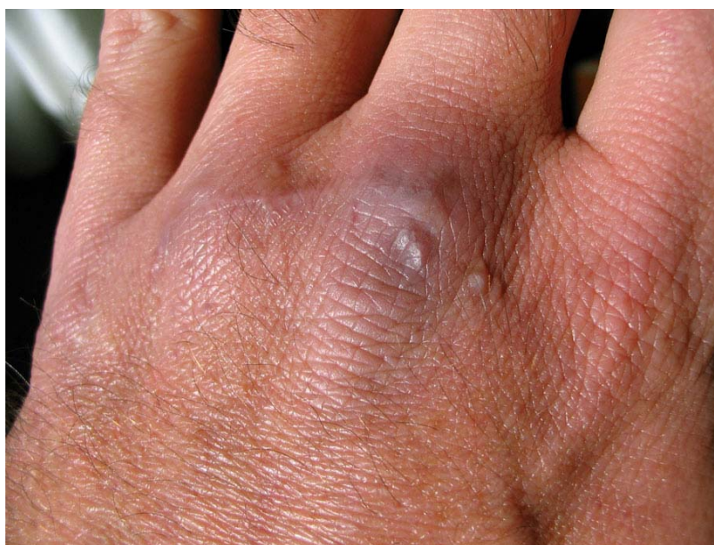
Figure 4. Total recovery of the wound after four months.