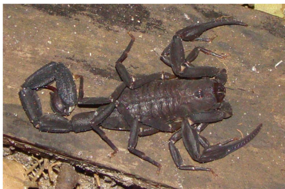
Figure 2 Female specimen of Tityus obscurus (Gervais, 1843) with length of 10 cm from the eastern region of Pará state, Brazil. It had been provided by a patient who was showing systemic manifestations upon hospital admission.

Most of the patients with confirmed envenomations were living in the eastern portion of Pará state ( n = 34, 71%), which presented an equal distribution of males and females whereas in the west males predominated. The ages of patients were similar in both areas with a median of 31.5 (23-41) years in the east, and 31.5 (20-50) years in the west, but the accidents happened mainly to patients older than 15 in both areas. The stings