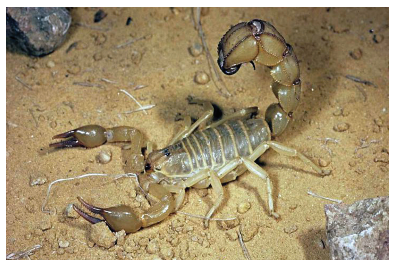
Figure 5. Androctonus australis, a very dangerous scorpion species, described for the first time in Mali (Gao district). This species requires a minimal hygrometry, and its presence is very likely along the river Niger towards other countries (Niger).