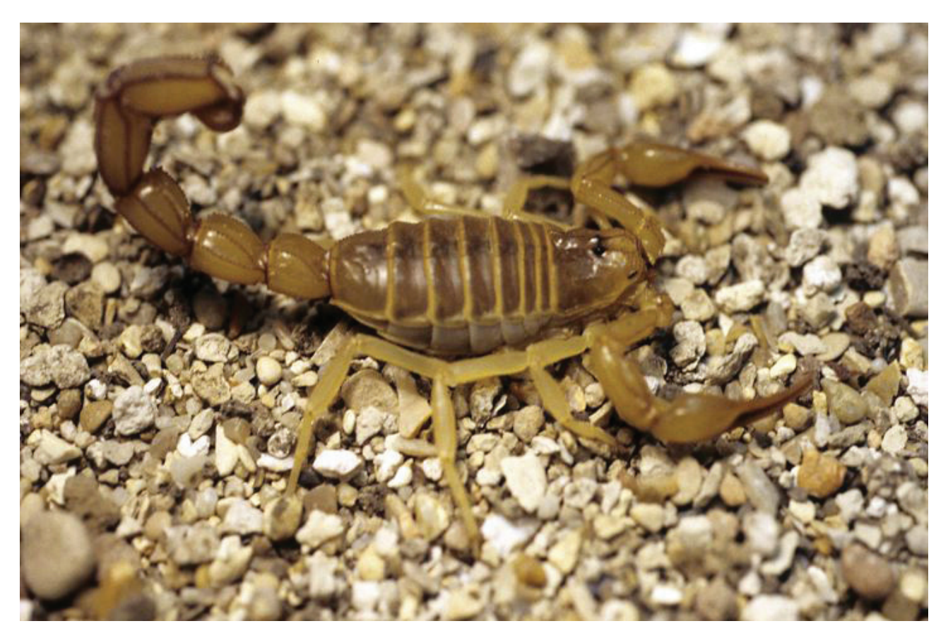
Figure 4. Androctonus amoreuxi, classically described as a non-dangerous scorpion species. In the desert regions of northeastern Mali, it appears to be dangerous.

unusually small adult size. To summarize, this population of A. amoreuxi requires further research studies due to the possible local presence of a highly venomous species or a subspecies that is dangerous to humans. This possibility has been previously discussed elsewhere (2). Local variations in the toxicity of venoms are well known, especially in species with a wide distribution such as A. amoreuxi (9).