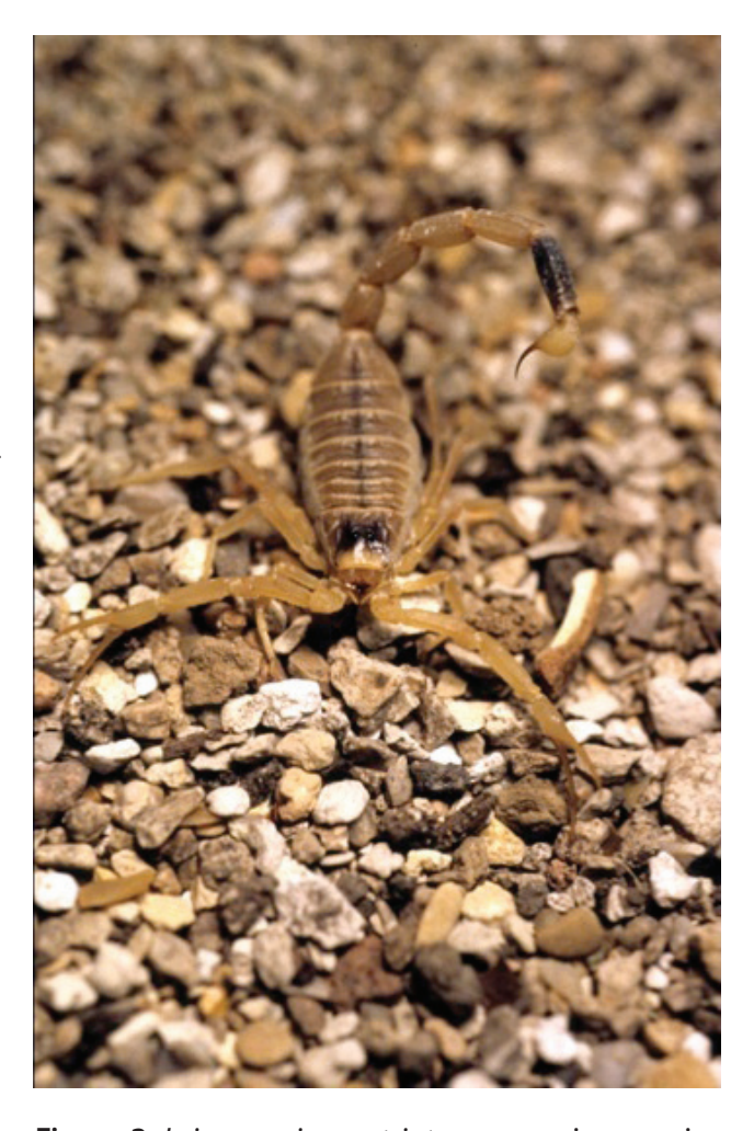
Figure 3. Leiurus quinquestriatus, a scorpion species very dangerous for humans, frequently described in Saharan desertic zones, sometimes with Androctonus amoreuxi.

Despite its size, it is usually considered harmless to humans. So, its relatively abundant presence in a batch of scorpions considered dangerous by the human populations of the districts of Tessalit and Kidal raises an important question: would the districts of Tessalit and Kidal not possess an A. amoreuxi population, perhaps a particular subspecies, with venom that is potent and toxic to humans? With a presence of eight A. amoreuxi specimens in a batch of 22 scorpions, the danger presented by this species needs to be reexamined. It is particularly important to experimentally evaluate the toxicity of its venom, given the