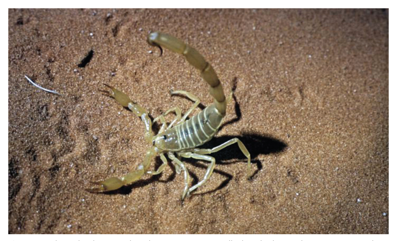
Figure 2. Buthiscus bicalcaratus, a harmless scorpion, principally described in southern Tunisia or southern Algeria. It is a Saharan species which is probably common in northeastern Mali

This species (Figure 2) is quite common in the northern Sahara. To the best of our knowledge, this is the first time it has been reported in Mali.