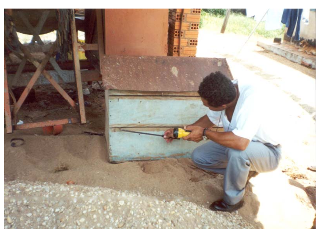
Figure 2: Government employee searching for triatomines during a visit to the peridomicile of a dog belonging to a patient with chronic Chagas' disease, in the studied area.