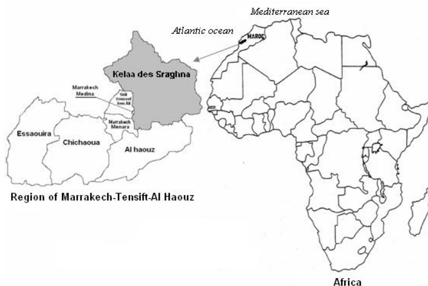
Figure 4. Geographic location of Kelâa des Sraghna province.

The province of Kelâa des Sraghna, presenting 10,070 km 2 total area, is 700 meters above sea level (latitude: 32°N; longitude: 7°W). It is part of the Marrakech-Tensift-Al Haouz region (one of the 16 Moroccan regions) which includes four provinces (Marrakech, Al Haouz, Chichaoua, Kelâa des Sraghna and Essaouira) and has a surface area of 31,460 km 2 (Figure 4). Moreover, the approximate total populations for this region in 2003 and 2004 were 3,064,000 and 3,105,000 inhabitants respectively. For the province Kelâa des Sraghna, the population was 752,000 inhabitants in 2003 and 760,000 inhabitants in 2004.