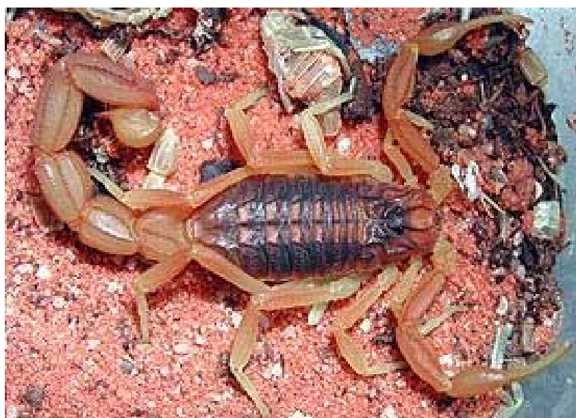
Figure 3. Buthus malhommei.

The current study aimed to determine the factors that can influence the evolution of scorpion envenomation in Kelâa des Sraghna province. In the same manner, we tried to elicit the epidemiological and clinical factors affecting the severity of this pathology in order to improve patient management and to reduce morbidity and mortality caused by these scorpion venoms.