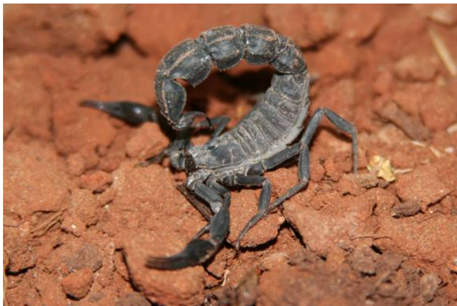
Figure 2. Androctonus mauritanicus (by Abdelmajid Soulaymani).