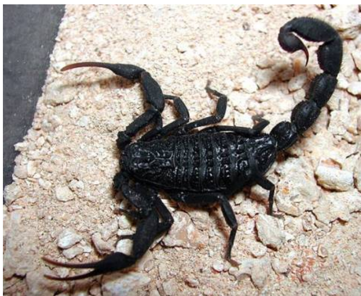
Figure 1. Hottentotta franzwernerii (by Eric Ythier).

The studied province presents elevated concern in relation to this problem due to its dry and arid climate, rocky relief and the presence of dangerous scorpion species including Androctonus mauritanicus (Pocock, 1902), Hottentotta franzwernerii gentili (Pallary, 1924) and Buthus malhommei (Vachon, 1949) (Figures 1, 2 and 3).