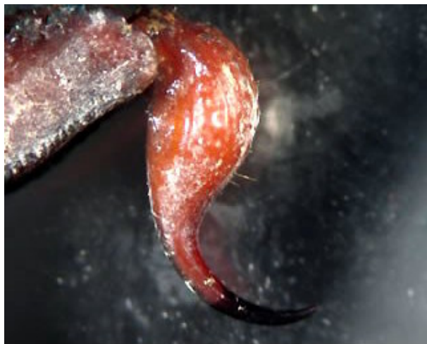
Figure 1: Telson of Androctonus crassicauda (by Ozkan O. et al. J. Venom. Anim. Toxins incl. Trop. Dis. , 2006, 12, 297-309).

In the determination of LD 50 values, Group 1 consisted of 64 mice in G1 a , 72 mice in G1 b , and 8 mice in the control group [G1 1 ]; Group 2 was comprised of 72 mice in G2 a , 72 mice in G2 b , and 8 mice in the control group [G2 1 ]; Group 3 presented 80 mice in G3 a , 80 mice in G3 b , and 8 mice in the control group [G3 1 ] (Tables 2A, 2B and 2C). The LD 50 was found (95% confidence limit – CL) for each group and is presented in Table 3.