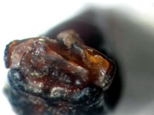
Figure 3: The view of a closed telson (by Ozkan O. et al. J. Venom. Anim. Toxins incl. Trop. Dis. , 2006, 12, 297-309).

Table 1: Groups of telsons and their morphometric characteristics. There were not statistically significant differences according to weight and morphometric parameters ( p>0.005 ).