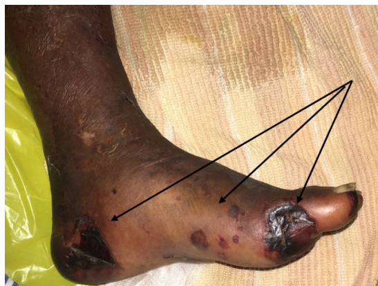
Figure 1. Discrete patchy gangrenous lesions in the left foot in keeping with distal thromboembolism 'Trash foot' (black arrows).

She was hemodynamically stable, but the entire lower extremity was severely swollen, cold, numb,