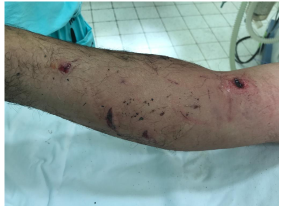
Figure 2. Blunt and penetrating lesions to the arm and forearm of the right upper limb.

While still in hospital, the patient was given saline, anti-rabies vaccine, and anti-tetanus vaccine, as instructed by the infectology service. He had good clinical progress and was discharged from hospital on the second postoperative day with a prescription for 100 mg aspirin once a day and told to consult