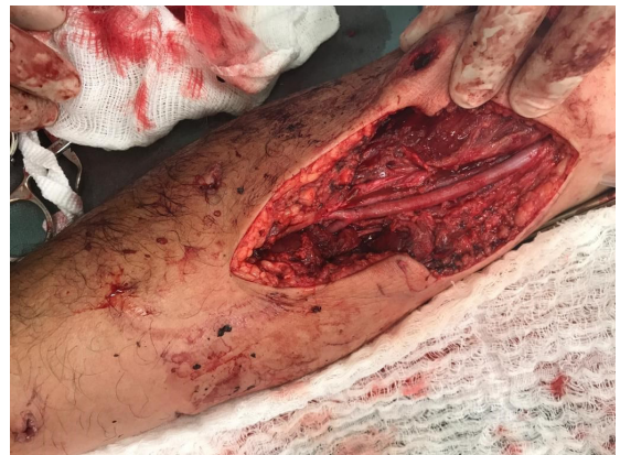
Figure 3. Result of surgical dissection, with exposure of the brachial artery and its bifurcation into the radial and ulnar arteries. Note the arteriorrhaphy of the brachial artery, performed after embolectomy with a Fogarty catheter.