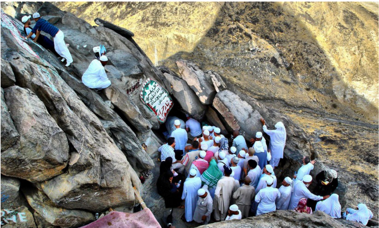
Figure 2 - Muslim peregrines gathering and entering de Hira Cave, in Mount Hira, Mecca

It is important to notice that the 18th Surah of the Qur'an is called The Cave (AL-KAHF). Full of symbolisms, this section depicts the cave as a safe place where a group of youngsters took refuge and says, "Lord, grant us Your mercy and prepare for us from our affair right guidance!" (Qur'an 18:10). In the same chapter, the youngsters would have "fallen asleep in the cave for years" (Qur'an 18:11) and "they remained in their cave for three hundred years and nine" (Qur'an 18:25).