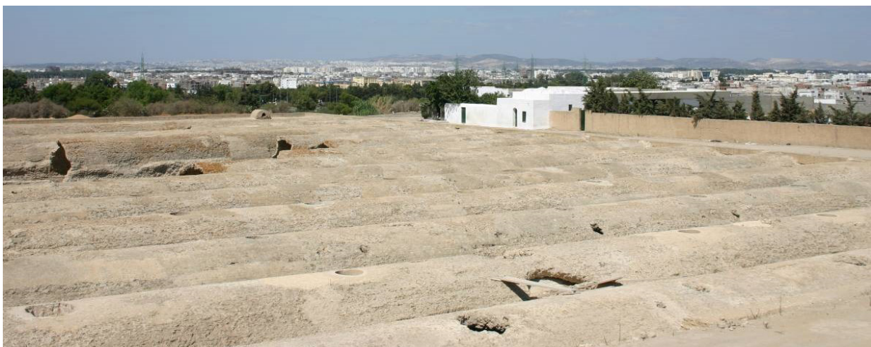
Figure 3 – Partial view above the Roman cisterns, south of Tunis, Tunisia

From Algiers, the capital city, Ibn Battuta went towards Tunisia, a country with extensive shallow and little karstified carbonate regions as well. However, the country also has extensive underground systems such as those cited by Perritaz (2004). One can identify the Rhar Ain et Tsab (2,700 m long and 160 m deep) and the Rhar Djebel Serdj (1,700 m long by 267 m deep). Thermal karst sources exist in this territory and some ancient Roman cisterns (Figure 3) were built in abundance as demonstrated by Travassos (2010). Such anthropogenic structures are extremely valuable and make the strategic value of karst landscape quite clear, particularly in relation to water availability since the “the cisterns, more precious than all other structures, have been always either kept up or repaired under every change of Government.” (RECLUS, 1876-1894, p.157). In the western portion of Tunisia, south of the city of Sfejerda, Reclus portrays the richness of water sources, “a feature of paramount importance in these arid regions. One of the springs starts up from a cavern decorated with Roman arcades, which can be followed for some distance into the interior of the rock.” (RECLUS, 1876-1894, p .180-181).