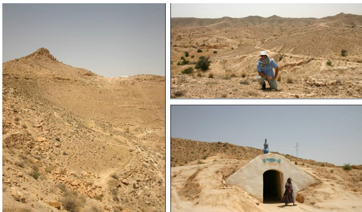
Figure 4 – Region of Matmata, located between Sfax e Gabès, Tunisia

Although not identified in the work of Battuta, the sacred underground was recorded by Elisée Reclus, an important French geographer of the nineteenth century. The first pages of the 11th Volume of his Universal Geography , dedicated to the African northwest, record the custom of burying the dead in caves. Cyrene, an ancient Greek colony (nowadays, Libya) is full of these “sepulchral caverns seen in thousands, and here and there the traces may still be distinguished of their polychrome decorations (...). Most of the tombs rest on crypts cut in the limestone cliff, which being of a porous nature, was easily worked on, and thus converted into a vast underground city”(RECLUS, 1876-1894). It is noteworthy that the graves are identified and described in abundance in Battuta’s text and maybe some of them were not identified because they were not part of the Muslim tradition.