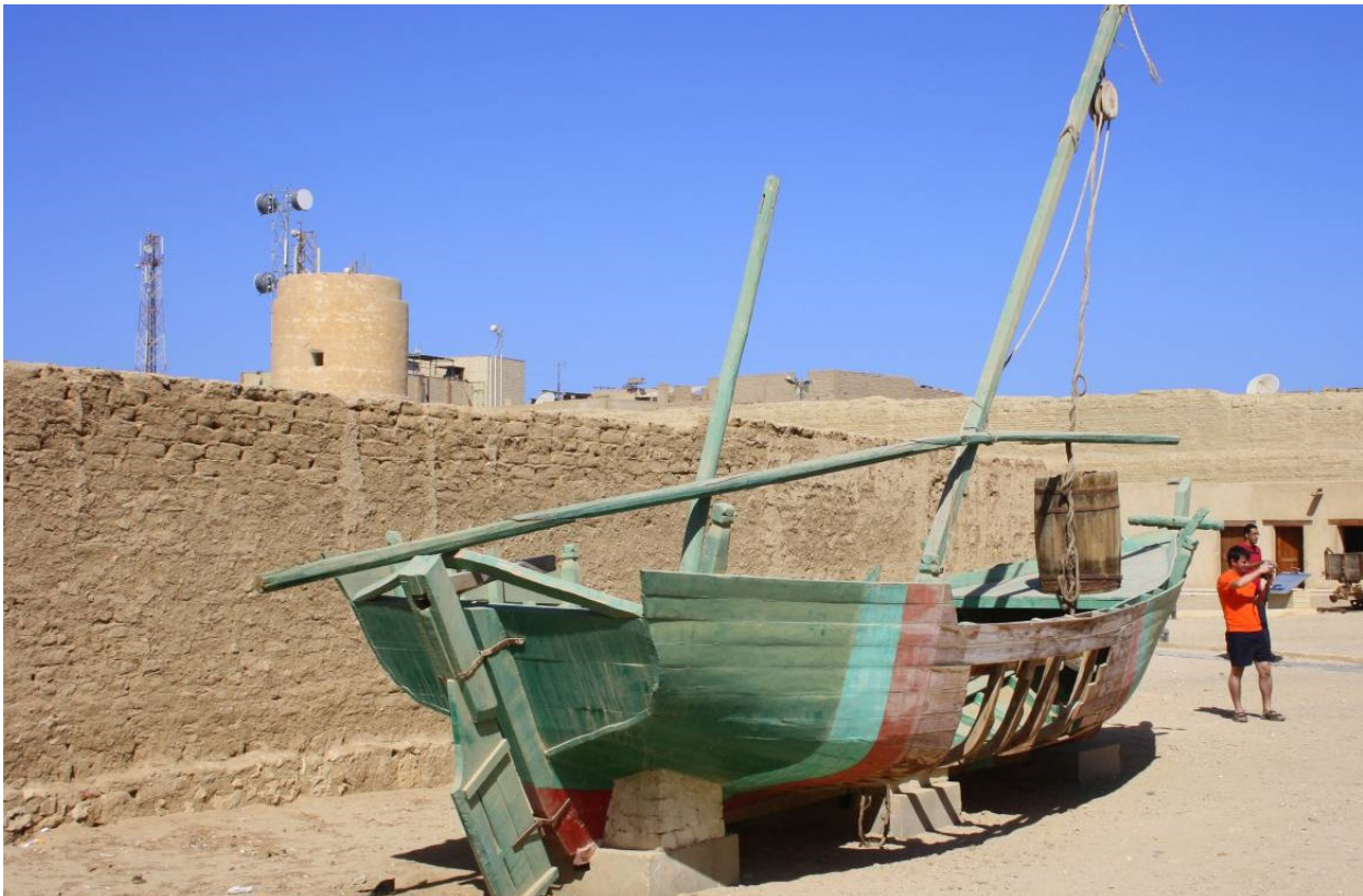
Figure 6 – Example of a vessel used by Muslims who went towards Mecca crossing the Red Sea.

Nowadays, in the city of El-Quseir, in Egypt, one can visit a fort built in 1571 which has a small museum which hosts an example of the many boats used to cross the Red Sea towards Mecca. It is reasonable to say that the boats used by Battuta could be of the same type or even less developed than the one shown in figure 6, since this dates back to the sixteenth century and Battuta’s maritime travel was made in the fourteenth century.