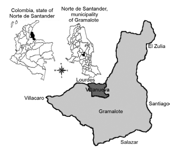
Fig. 1: study area: Villanueva, municipality of Gramalote, Norte de Santander, Colombia.

The specimens collected were preserved in 70% alcohol and taken to the Laboratory of Medical Entomology of the Biomedical Sciences Institute of Pamplona