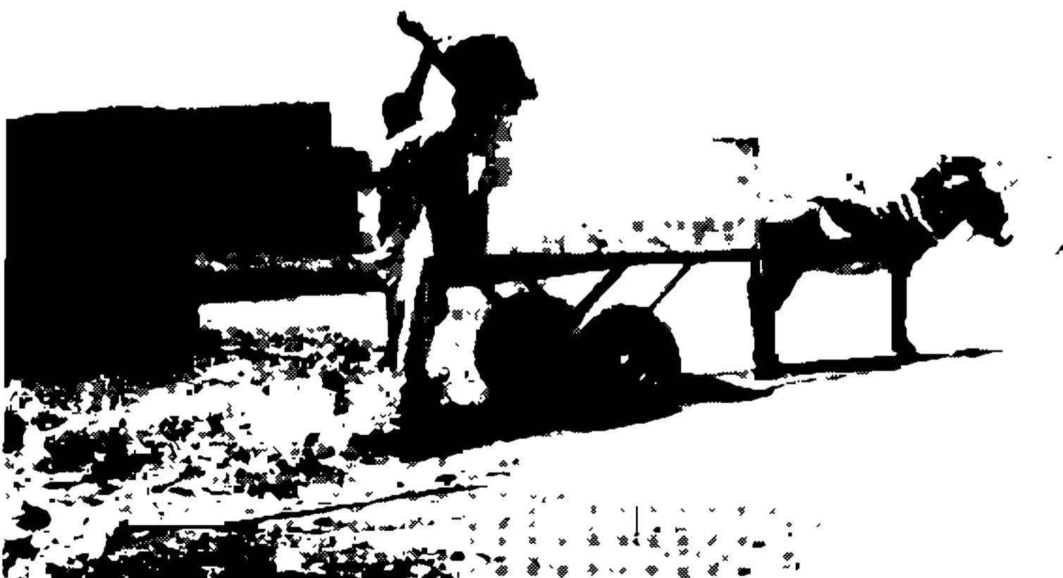
Nº3 Garbage collection in the village and disposal by a donkey-cart (cheap applied technology).