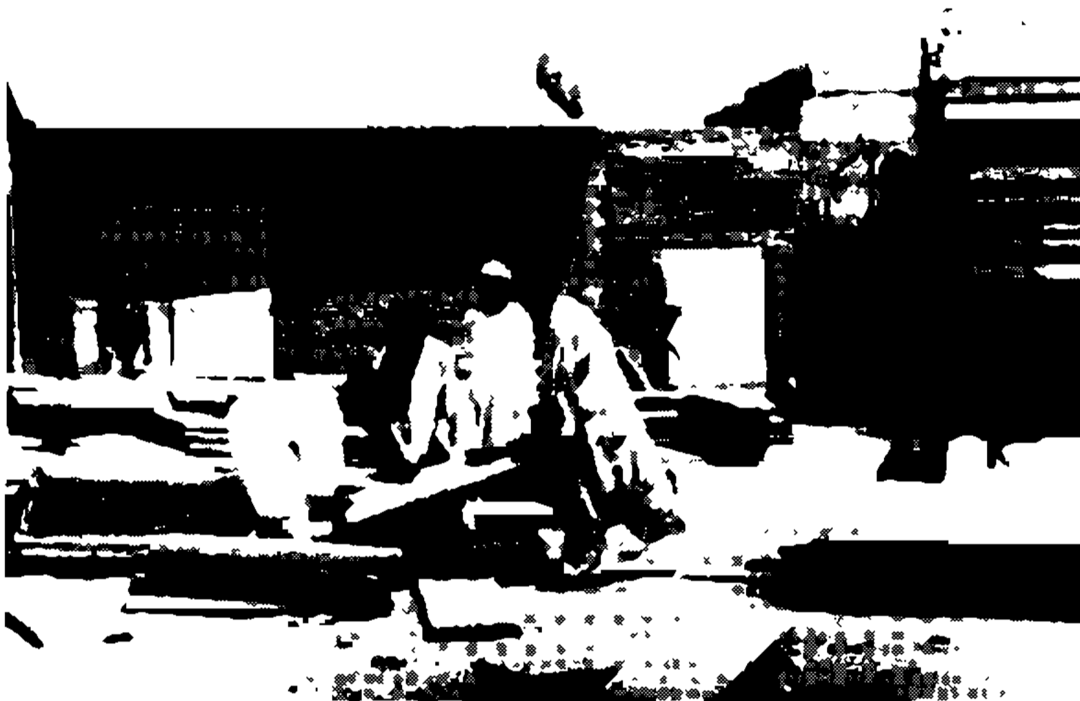
Nº2 Transportation of concrete latrine slabs from the slab factory for distribution to the villages.