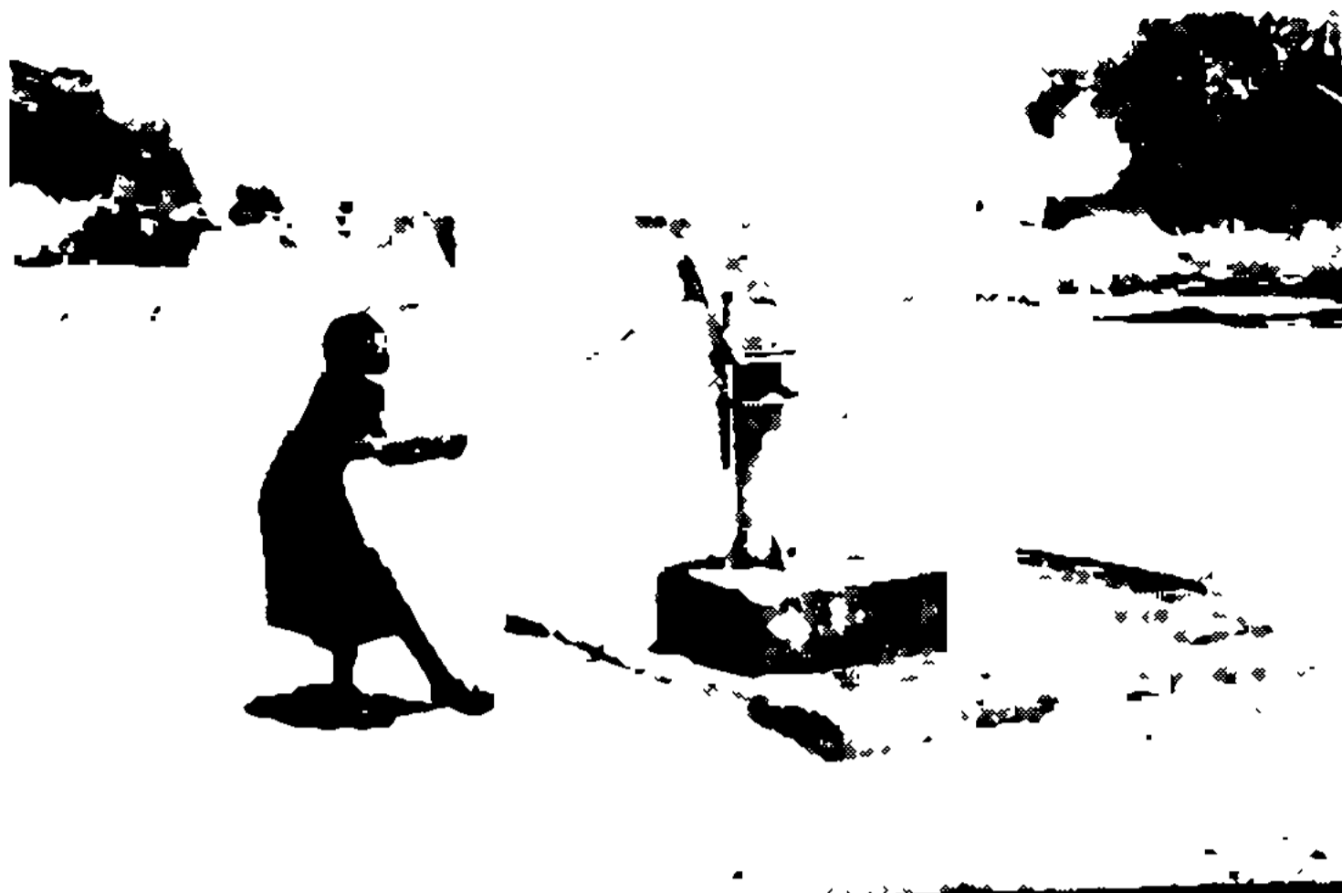
Nº1 Drawing clean water from a shallow well by a hand pump.