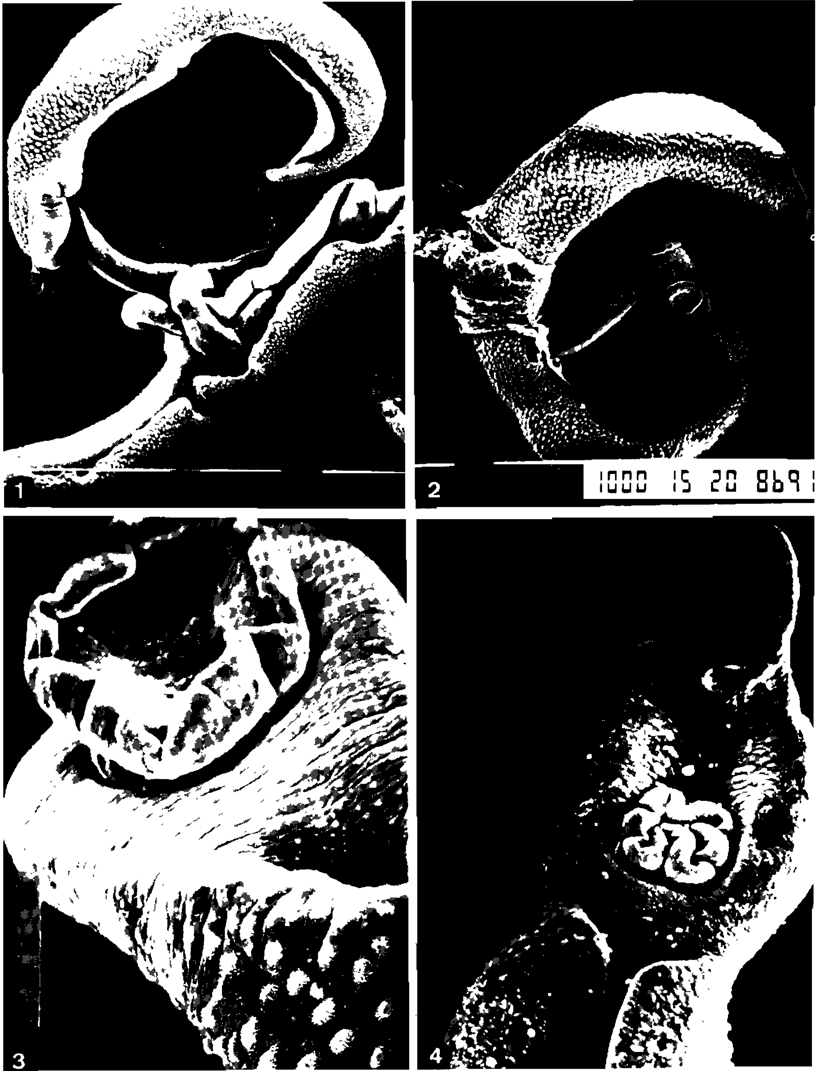
Scanning electron micrographs — Fig. 1: normal worms — (46x). Fig. 2: general view of worms showing accumulation of membranous material around the surface with host cells — (46x). Fig. 3: ventral sucker with pronounced swelling of surface, 72 h after treatment — (360x). Fig. 4: ventral face of male worm with profound alterations on the entire surface and swelling of ventral sucker, 96 h after treatment — (250x).