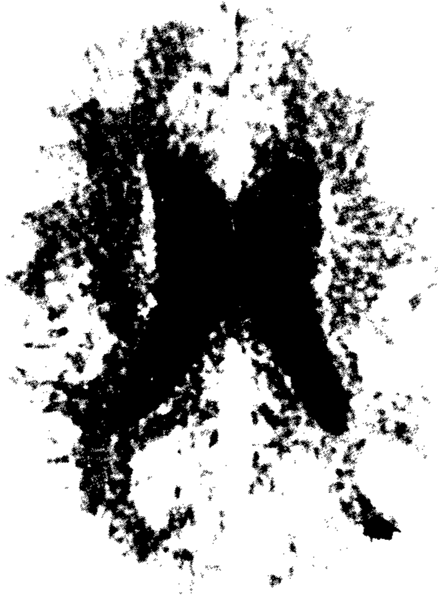
Fig. 2: computed tomographic scan of the brain showing a subcortical left temporo-occipital pseudotumoral lesion, enhanced after intravenous injection of contrast (Arrow).

Several cases of reactivation of Chagas' disease in HIV positive patients, manifested as meningoencephalitis and/or myocarditis have already been reported in the literature. Many more are expected to be diagnosed in the near future. As it is a blood-borne disease, American trypanosomiasis can be transmitted within the drug addict population, although to our knowledge this has not been reported so far.