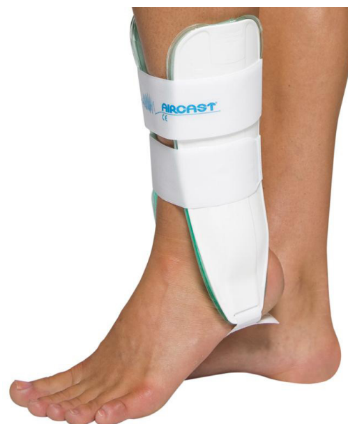
Figure 3. Semi-rigid brace used for ankle stabilization (Aircast Air Stirrup®).

Absolute error (AE) and variable error (VE) were calculated. According to Magill (2000), the AE is the absolute difference between real performance in the attempts and the goal. This value provides information regarding the performance error, which indicates a general index of precision. The same author defines VE as an error of performance which assesses the consistency (accuracy) for a series of trials. Together, these error-measures rate allow us to evaluate the performance in skills whose goal is action with precision and accuracy.