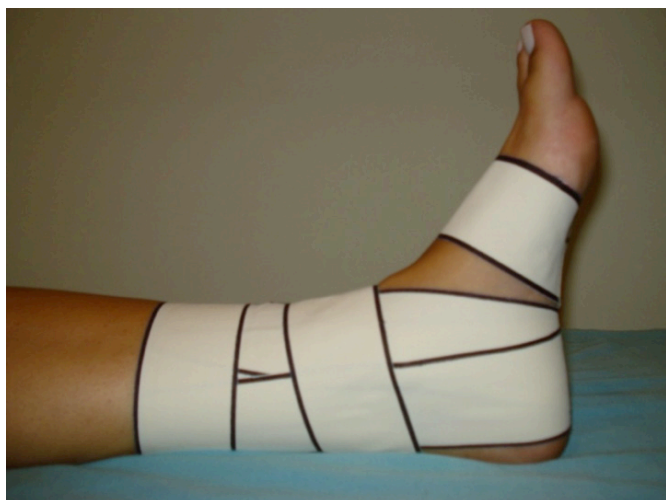
Figure 2. Technique used for taping application (medial view).

execution of the task. Before beginning the data collection, the volunteers were given sufficient time to adapt themselves to the experimental setup. Adaptation was assured by maintaining the joint in the targeted position for 10 seconds. This procedure was repeated as many times as necessary. After the adaptation period, position sense was measured. The protocol used to evaluate the position sense consisted of active movements performed at 10^{\circ}/s . This velocity was set in order to allow the dynamometer arm to be free for motion. All the volunteers performed the task in a velocity slightly slower than 10^{\circ}/s with no resistance coming from the machine. The order of the target angular position was randomly set. Three repetitions with a time interval of 20 seconds between the repetitions were performed for each of the four targets. Every three ankle movements, volunteers rested for 10 minutes while the target angle was set in the next position. The volunteers were instructed to press the locking device button (to record the angle) when they thought that they were at the target position. In one single session, the same evaluation was performed for each of the three experimental conditions, with a time interval of 15 minutes between them, in the following order: 1) no orthosis device, 2) wearing semi-rigid ankle bracing, and 3) wearing taping.