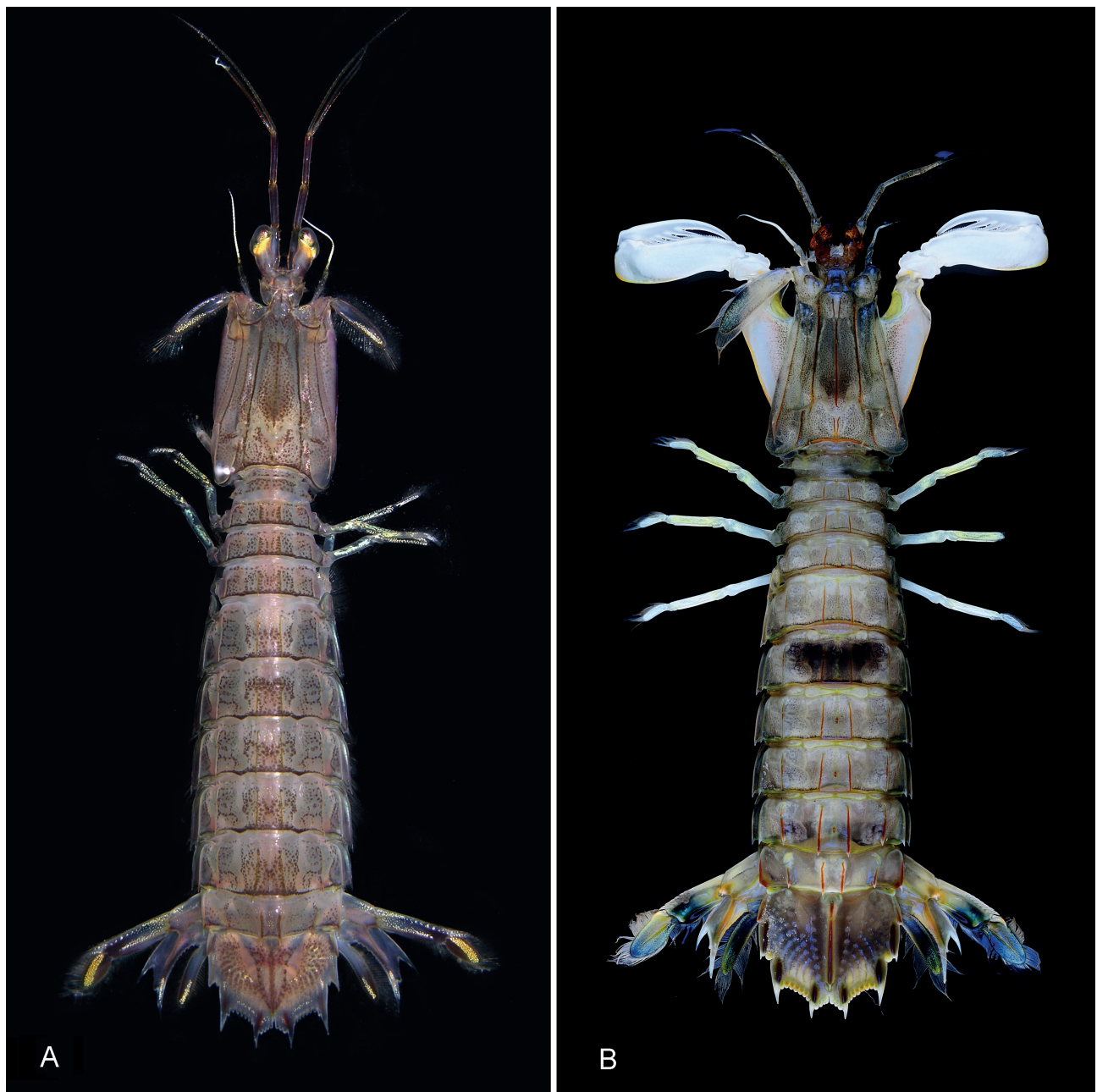
Figure 3. A, Michalisquilla parva (Bigelow, 1891) n. comb., male, TL 44 mm, Taboga Island, Panama (FLMNH UF 19464). B, Vossquilla kempii (Schmitt, 1929) n. comb., male, TL 112 mm, Kinmen, Taiwan (AM P99511).

Thoracic somites 6–8 submedian carinae weakly divergent. Thoracic somite 5 lateral process anterior lobe spiniform, recurved anterolaterally; posterior lobe short, sharp. Thoracic somite 6 lateral process anterior lobe slender, width about half length, less than one-third width of posterior lobe; posterior lobe large, triangular. Thoracic somite 7 lateral process broadly triangular, anteriorly margin straight or with low blunt swelling. Thoracic somite 8 lateral process triangular, apex blunt; sternal keel rounded.