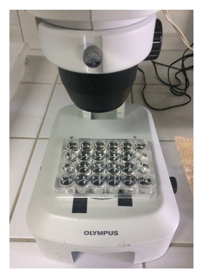
Figure 1. Leptuca leptodactyla. Inspection of the presence of exuviae and counting of dead larvae under stereomicroscope. Each well contained one larva.

The experiment was concluded when no live zoeas were found in the experimental treatments either because they reached megalopa stage or had died.