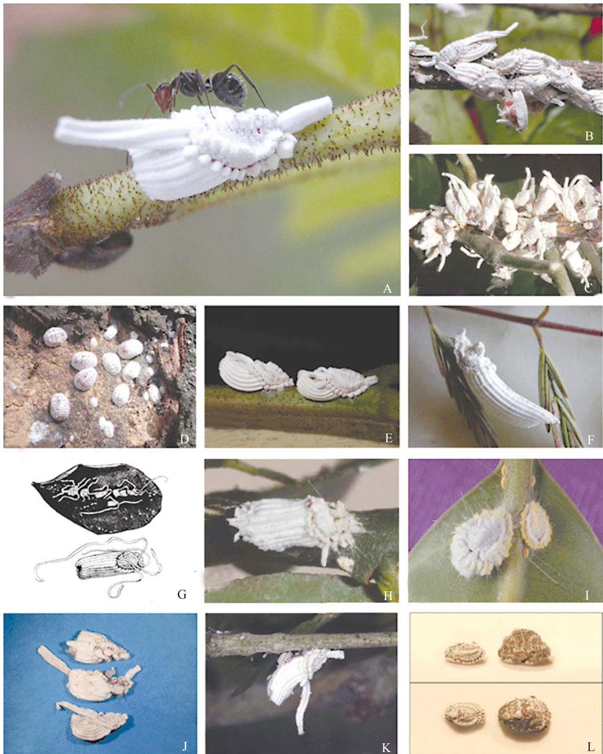
Fig 1 Photographs and illustrations of various Neotropical iceryine species. A, Crypticerya multicatrices sp. n. on Caesalpinia peltophoroides . B, C. multicatrices sp. n. on Annona muricata . C, C. multicatrices sp. n. on Mangifera indica . D, Crypticerya abrahami on Pithecellobium dulce (Colombia). E, Crypticerya brasiliensis (Guyana). F, Crypticerya genistae on Caesalpinia cariaria (Aruba). G, Crypticerya montserratensis (reproduced from illustration by Riley and Howard (1890); H, Icerya purchasi on Phoradendron flavescens (USA); I, Icerya seychellarum , notice slender glassy filaments (Thailand); J, Crypticerya similis (photo taken from Type dry material); K, Crypticerya zeteki (Panama); L, Echinicerya sp. (Photos A-D, H-J by T Kondo; E, by J H Martin; F, by P J Gullan; K, by C Darling; L, by C M Unruh).