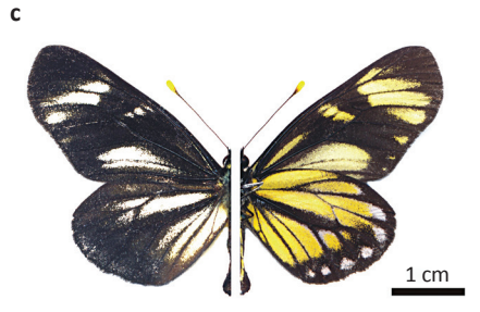
Fig 1 Habitat and adults of Charonias theano in Serra do Japi, Jundiai, São Paulo, Brazil. a) General view of the habitat where the first male was observed on April 2011; b) Adult male feeding on Eupatorium gaudichaudianum (Asteraceae); c) Museum specimen of an adult male showing the wing pattern (dorsal left, ventral right).

Brown 2005, Freitas et al 2009, Freitas 2010), and also in the recognition and description of several new species (Francini et al 2004, Freitas 2004, 2007, Freitas et al 2010, 2011). From 1999 to 2007, during the research project "Borboletas do Estado de São Paulo" (Biota-Fapesp Research Program) many different habitats were intensively sampled in this state, aiming to produce lists of species in poorly known areas and to search for endangered and long unseen butterfly species, including C. theano . Despite all these efforts, the species remained unrecorded until the present observation in April 2011 in the Serra do Japi.