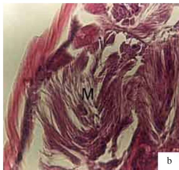
Figure 1. Cross sections of adults lice untreated (a) and treated (b) with T. minuta oil showing disassembly of muscular filaments (M). (a): 400 x ; (b): 200x