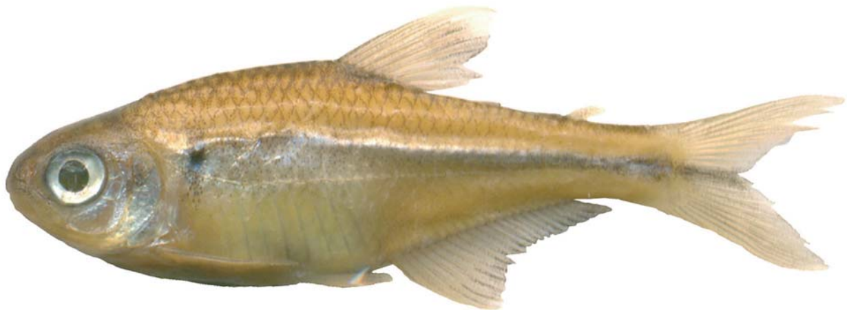
Fig. 1. Knodus shinahota , holotype, LIRP 5722, 33.7 mm SL (male): Bolivia, río Shinahota, río Chapare basin, río Mamoré system.

Diagnosis. Knodus shinahota can be distinguished from all congeners except K. chapadae and K. geryi by having six rows of scales between the lateral line and the dorsal-fin origin ( vs 4 or 5 rows of scales in the other species). Knodus shinahota differs from K. chapadae by possessing more rows of scales between the lateral line and the pelvic-fin origin (5 vs 3½ or 4, respectively) and more lateral line scales (38-41 vs 36-38, respectively). Knodus shinahota differs from K. geryi