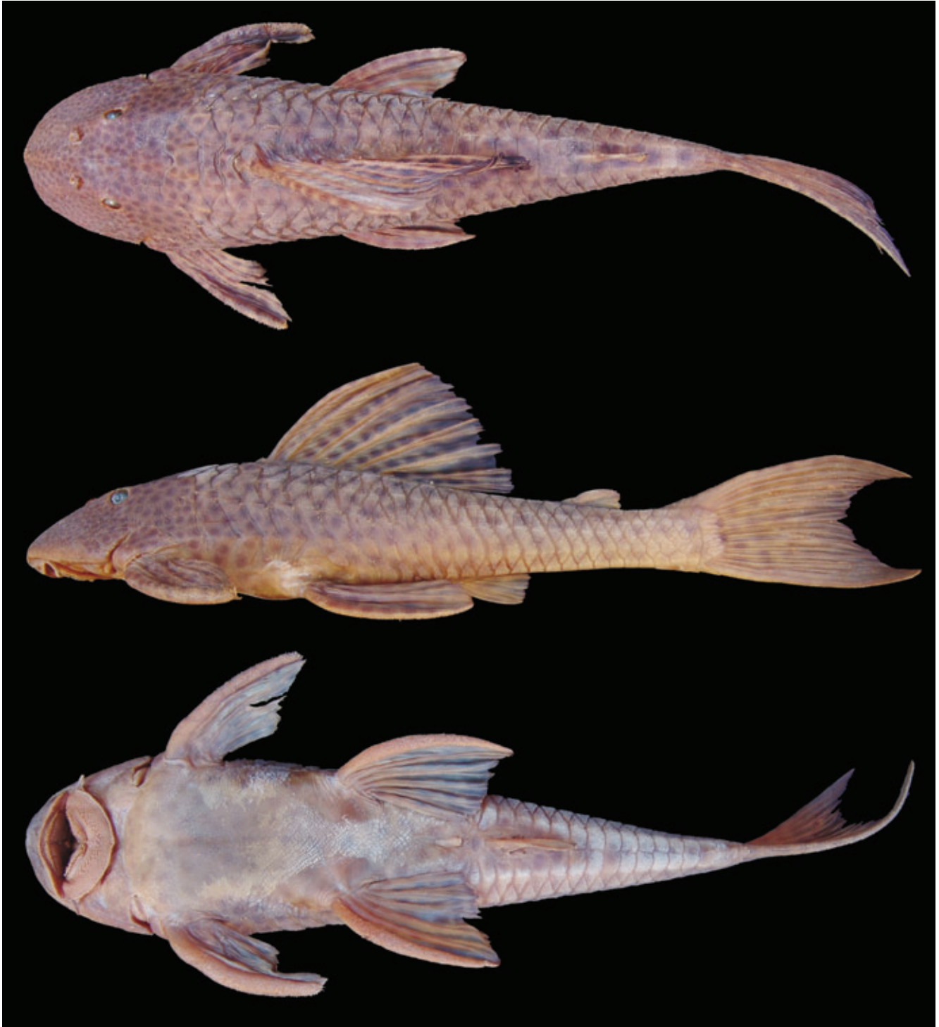
Fig. 4. Hypostomus derbyi , NUP 677, 230.6 mm SL, Salto Caxias reservoir, rio Iguaçu, Municipality of Capitão de Leônidas Marques/Nova Prata do Iguaçu, Paraná, Brazil.

near its foz at Caxias reservoir, Municipality of Cruzeiro do Iguaçu/Nova Prata do Iguaçu, 25°34'27"S 53°05'49"W, 20 Jan 1999, Nupélia. NUP 1828, 7, 184.0-224.0 mm SL, Salto Caxias reservoir, rio Iguaçu, Municipality of Capitão de Leônidas Marques/Nova Prata do Iguaçu, 25°32'12"S 53°29'11"W. Nupélia. NUP 2541, 6, 129.8-270.0 mm SL, Foz do Areia reservoir, rio Areia, Municipality of Cruz Machado/Bituruna, 26°00'05"S 51°39'23"W, 27 Oct 1998, Nupélia. NUP 2542,