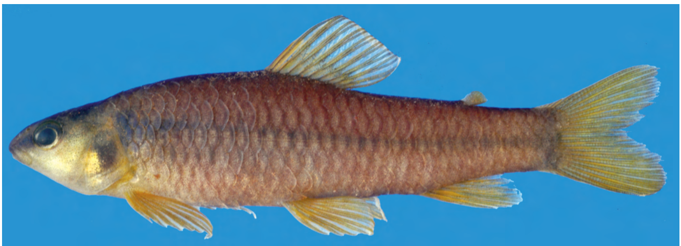
Fig. 1. Characidium xanthopteron , holotype, DZSJRP 10474, 47.3 mm SL, freshly preserved specimen.

Description. Based on specimens from upper rio Paraná basin. Morphometric data in Table 1. A medium-sized Characidium , largest specimen examined 47.3 mm SL. Body