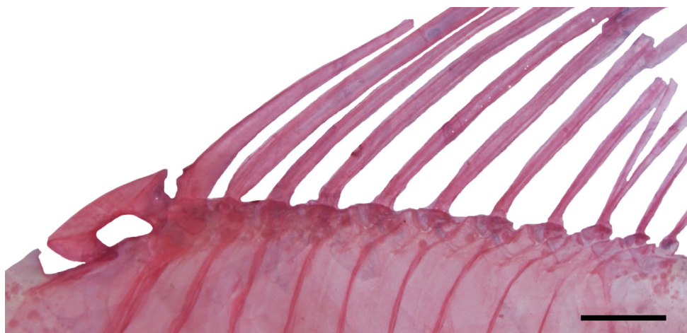
FIGURE 2 | Predorsal spine and dorsal-fin rays of Poptella fortispina , LBP 16681, paratype, 32.1 mm SL, lateral view, left side. Scale bar = 1 mm.

Dorsal-fin rays iii,9*(124). First dorsal-fin element modified into well-developed spine. Anterior end of predorsal spine rounded and ventrally concave, saddle-shaped (Figs. 2–4). Predorsal-spine origin anterior to vertical through middle of standard length. First unbranched dorsal-fin ray shorter than second one. Second unbranched and first branched dorsal-fin rays slightly longer than following ones. Adipose fin present. Anal-fin rays iv* (124) or v (1), 25 (1), 27 (7), 28 (33), 29 (44), 30 (26), 31 (13), 32 (1). Pectoral-fin rays i,10 (20), i,11* (98) or i,12 (7). Posteriormost unbranched and first branched anal-fin rays longer than branched rays. Tip of pectoral fin reaching middle of when depressed pelvic fin. Pelvic-fin rays i,7* (125). Tip of pelvic fin reaching first two small unbranched anal-fin rays when depressed. Caudal fin i,16,i (1) or i,17,i (8). Dorsal procurrent caudal-fin rays 10 (2) or 11 (2); ventral procurrent caudal-fin rays 8 (3) or 9 (1). Caudal fin forked, lobes somewhat pointed and of similar size.