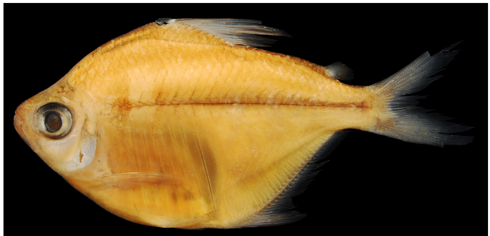
FIGURE 1 | Poptella fortispina , holotype, INPA 59843, 53.3 mm SL, Brazil, Pará, rio Xingu basin.

Paratypes. All from Brazil, rio Xingu basin. State of Pará: INPA 52827, 39 (20, 38.3–60.8 mm SL), same data as holotype. ANSP 194605, 1, 31.7 mm SL, rio Bacajái, sand/gravel shoal and rocky outcrop ca. 2.2 and 3 river km, respectively, upstream from the confluence with rio Xingu, 03°35'30.4"S 51°45'156.3"W, 16 Sep 2013, M. H. Sabaj Pérez, L. M. Sousa, A. Gonçalves, N. K. Lujan, D. B. Fitzgerald, P. Madoka Ito, A. Oliveira, R. Robles & fishermen. ANSP 194636, 10, 31.0–39.4 mm SL, rio Itatá ca. 1.1 river km upstream from confluence with right bank of rio Xingu, 03°37'15.7"S 51°49'14.1"W, 17 Sep 2013, A. O. Sawakuchi, J. L. Antinao Rojas, M. H. Sabaj Pérez & fishermen. ANSP 197062, 1, 22.4 mm SL, rio Bacajái, a shallow channel through forest and flooded sedges, ca. 5 river km upstream from the confluence with rio Xingu, 03°36'13"S 51°46'03.5"W, 10 Mar 2013, A. O. Sawakuchi, J. L. Antinao Rojas, M. H. Sabaj Pérez & fishermen. INPA 59846, 4, 31.4–37.4 mm SL, Travessão, rio Xingu, 08°17'41"S 55°12'67"W, 5 Aug 2015, F. C. T. Lima, O. Oyakawa, W. Ohara & M. Pastana. LBP 16680, 4, 38.3–40.5 mm SL, rio Xingu, 03°37'14.3"S 52°02'19"W, 30 Sep