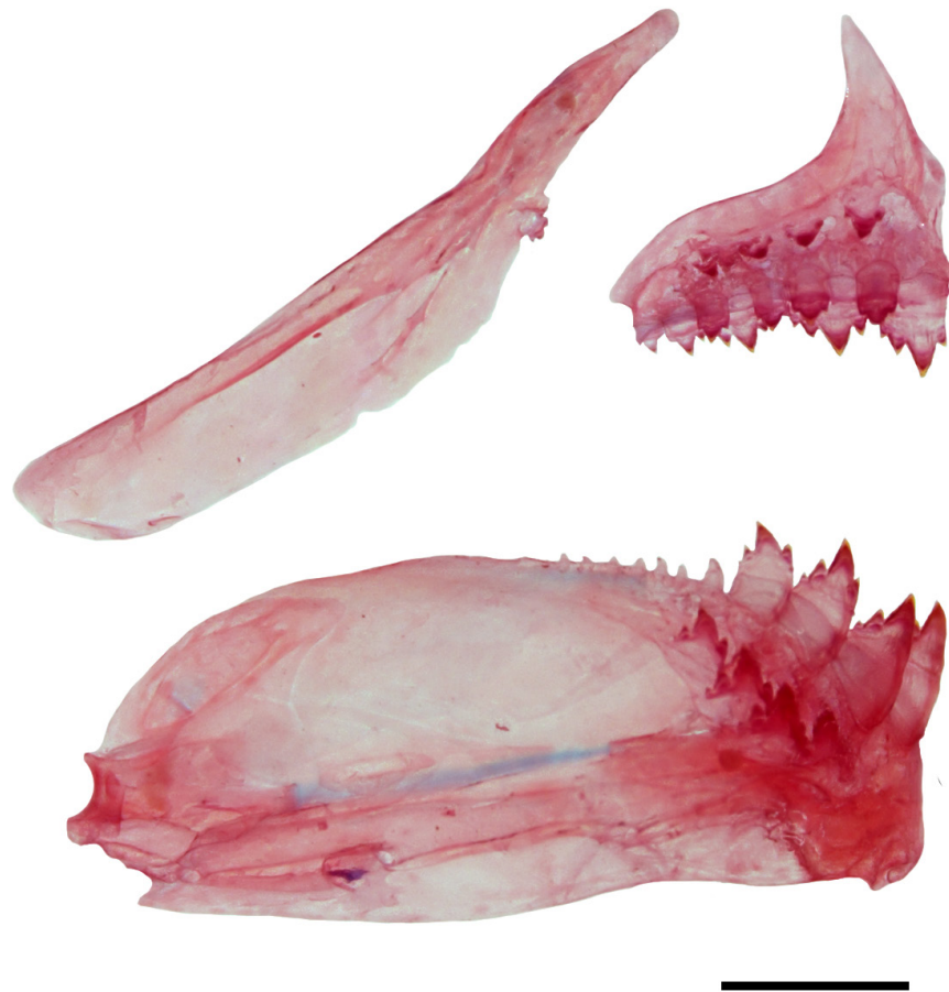
FIGURE 3 | Premaxilla, maxilla, and dentary of Poptella fortispina , LBP 16681, paratype, 33.7 mm SL, lateral view, right side. Scale bar = 1 mm.

Coloration in alcohol. General body color yellowish. Dorsal portion of head and body darkly pigmented. Chromatophores concentrated on snout, jaws, dorsal portion of neurocranium and along dorsal midline of body. Posterior portion of scales slightly dark and generally delineated by dark chromatophores. Two vertically elongated humeral blotches, extending up to six horizontal scale rows above lateral line and one scale row below lateral line, and separated by two horizontal scale rows. First blotch more conspicuous, with concentration of dark chromatophores forming a darker round blotch just above lateral line. Second humeral blotch faint. Narrow longitudinal dark line with chevron-like marks running along horizontal septum, extending from humeral