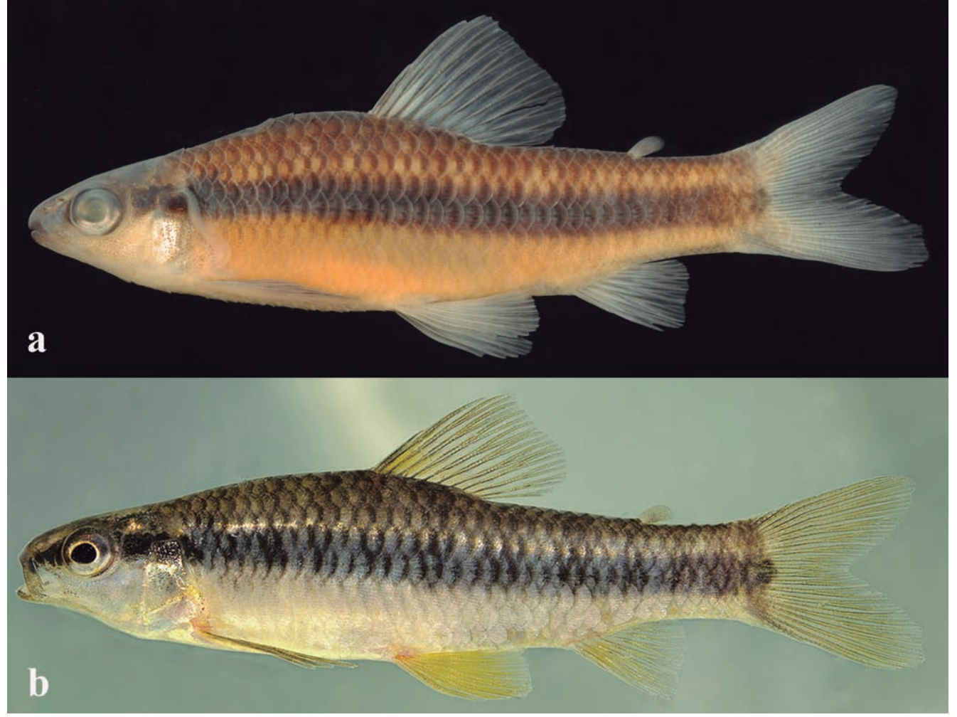
Fig. 1. Characidium samurai , holotype, MZUSP 108188, 46.6 mm SL, rio do Peixe, rio das Almas basin: (a) preserved specimen and (b) photographed live.

samurai can be further distinguished from congeners by the absence of dark bars or spots on the fins, except for a faded dorsal-fin bar (vs. presence of conspicuous dark bars or spots at least on one fin in C. alipioi , C. brevirostre , C. declivirostre , C. gomesi , C. grajahuensis , C. hasemani Steindachner, C. japuhybense , C. lauroi , C. macrolepidotum , C. occidentale , C. oiticicai , C. orientale , C. papachibe , C. pterostictum Gomes, C. rachovii , C. serrano , C. schubarti , C. steindachneri Cope, C. timbuiense , C. vestigipinne , C. vidali , and C. zebra ), and analfin rays ii,7-8 (vs. ii,6 in C. brevirostre and C. roesseli Géry).