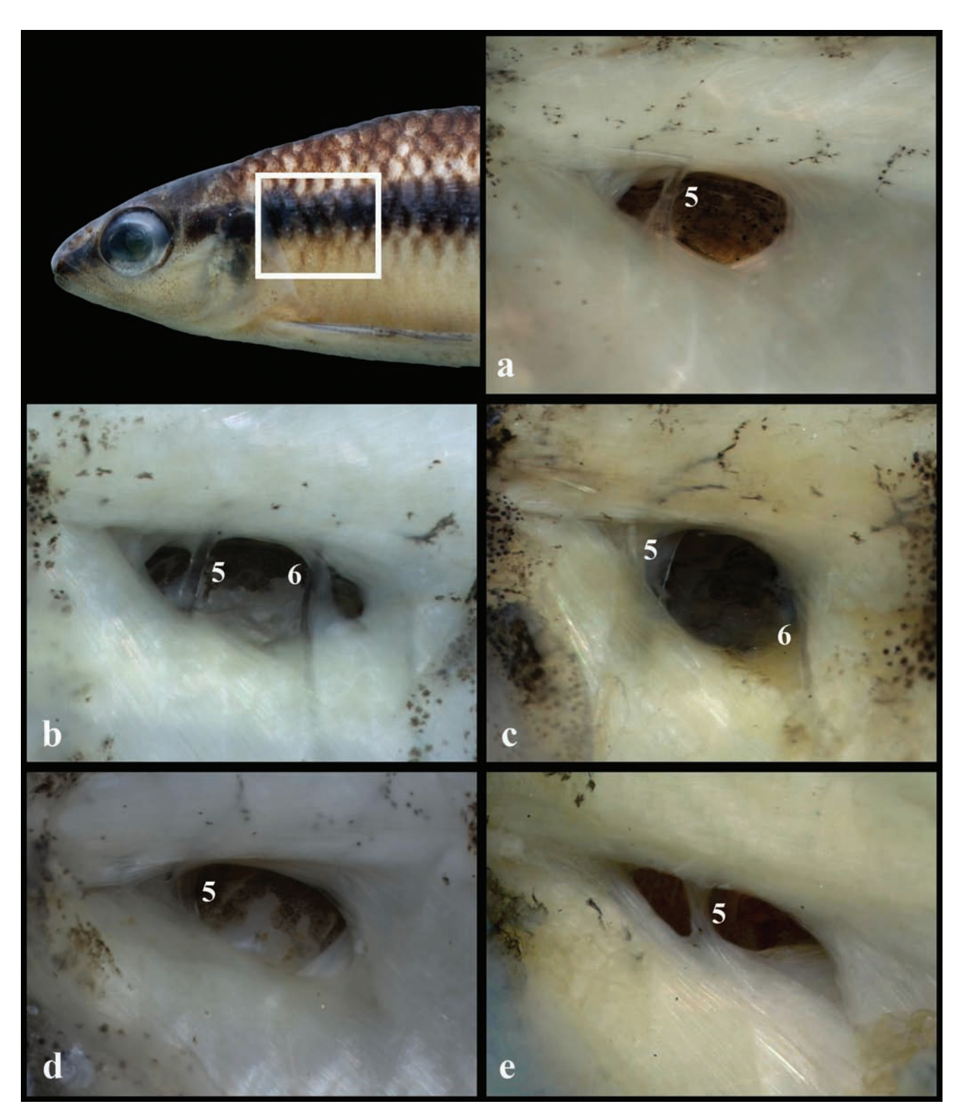
Fig. 3. Pseudotympanum of: (a) Characidium bahiense UFBA 3470, 23.2 mm SL, (b) C. bahiense UFBA 7167, 25.4 mm SL, (c) C. samurai , paratype, UFBA 7259, 41.2 mm SL, (d) C. bimaculatum UFBA 3829, 29.5 mm SL, and (e) Characidium timbuiense UFBA 6506, 32.8 mm SL. Numbers correspond to vertebrae associated with pleural ribs. Left side, anterior to left. Overlying skin, adipose tissue and lateral-line nerve removed.

genus ( e.g. , Graça et al. , 2008; Silveira et al. 2008; Mirande, 2010; Peixoto & Wosiacki, 2013).