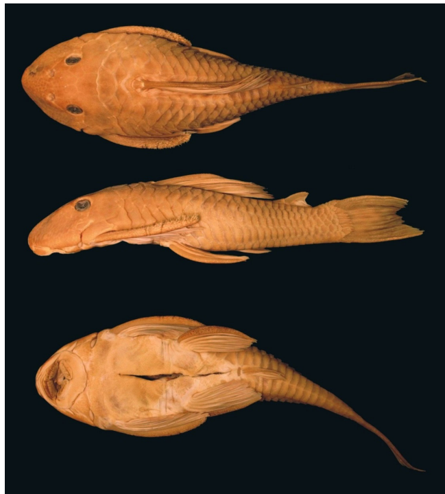
FIGURE 2 | Hypostomus hermanni , BMNH 1905.6.9.5, holotype, 201.8 mm SL; Brazil, São Paulo State, Piracicaba, Piracicaba River, Upper Paraná River basin. Dorsal, lateral and ventral views.

specimens (about 150 mm SL, NUP 16526); when adpressed reaching from one third to half pelvic-fin spine. Pelvic fin i,5 with branched rays slightly decreasing in size posteriorly; its distal border straight to slightly convex. Pelvic-fin spine flexible, curved inward; when adpressed surpassing anal-fin insertion. Anal fin i,4; when adpressed, distal tip of posterior rays reaching sixth to seventh plate posterior to its origin. Caudal fin i,7,7,i; truncate to slightly emarginate.