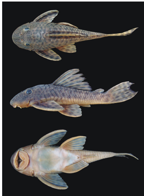
FIGURE 1 | Hypostomus hermanni , NUP 16526, topotype, 134.4 mm SL; Brazil, São Paulo State, Piracicaba, Piracicaba River, Upper Paraná River basin. Dorsal, lateral and ventral views.