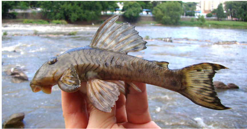
FIGURE 3 | Hypostomus hermanni , in life. NUP 16526, topotype, 134.4 mm SL; Brazil, São Paulo State, Piracicaba, Piracicaba River, Upper Paraná River basin.

Coloration in life. The same pattern which was described for alcohol preserved specimens, but with greenish background color tan and blotches darker (Fig. 3).