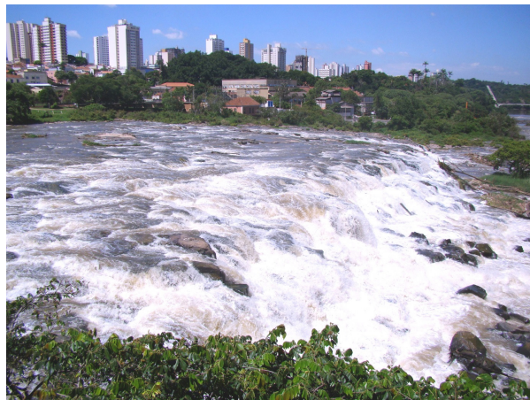
FIGURE 4 | Salto de Piracicaba, Piracicaba River, tributary of Tietê River, Upper Paraná River basin. The most probable type-locality spot of Hypostomus hermanni . Brazil, São Paulo State, Piracicaba, 22°43'15"S 47°39'22"W, 474 m.

Geographical distribution and type-locality. Hypostomus hermanni was described from the type-locality Piracicaba. The species is known from the Piracicaba River (Fig. 4), and the Tietê River basin in the state of São Paulo, Southeastern Brazil. Additionally, the species is herein also recorded in the Paraná River main channel and three of its left tributaries, Paranapanema, Ivaí, and Piquiri basin, in the state of Paraná, Southern Brazil (Fig. 7). As specimens of H. hermanni are mainly found in shallow to moderate shallow running waters, if Ihering (1911) referred the type-locality Piracicaba River as the Piracicaba city, the most probable collecting spot of the holotype was the Salto de Piracicaba, a single rocky rapid stretch in the Piracicaba River at Piracicaba city (Fig. 4).