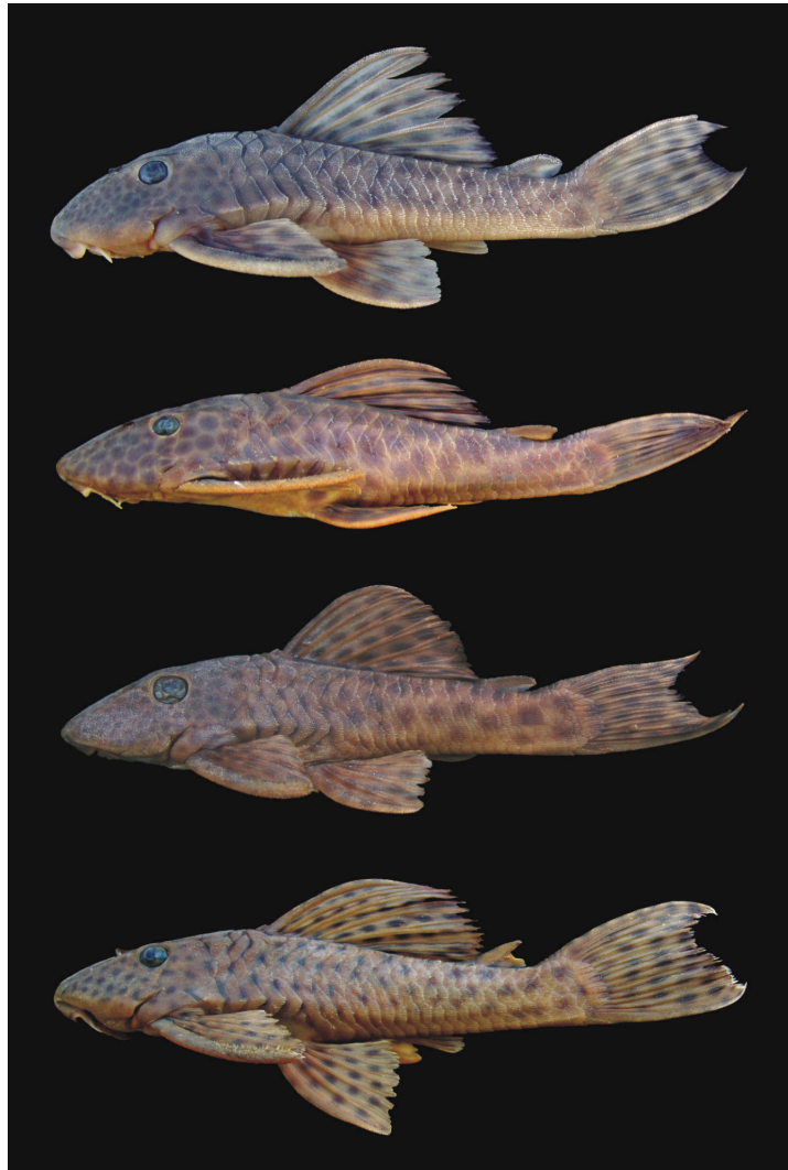
FIGURE 9 | Hypostomus hermanni , from different sub basins in the Upper Paraná River basin. From top to bottom: NUP 16526, 134.4 mm SL, Tietê River; NUP 14995, 152.2 mm SL, Tibagi River; NUP 5584, 128.1 mm SL, Piquiri River; NUP 5402, 175.1 mm SL, Ivaí River.

Piquiri River (Bueno et al. , 2013, 2014) and those from its type-locality the Piracicaba River (Rubert et al. , 2016) presented multiple sites of the 5S rRNA through the 5S rDNA-FISH technique, while Kamei et al. (2017) found to H. robertsoni ( Hypostomus aff. hermanni in that work) a single 5S rRNA fluorescent site.