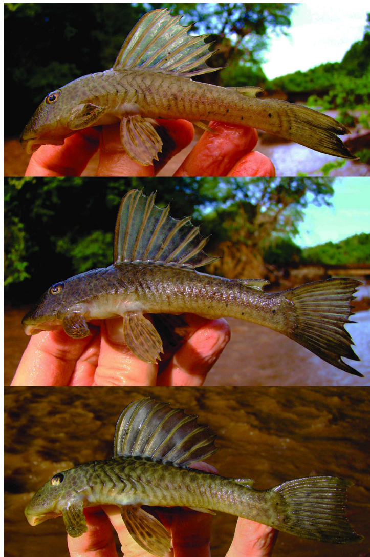
FIGURE 6 | Specimens of Hypostomus robertsoni in life, with inconspicuous dorsal fin dark blotches.

Color in life. Color in life similar to that on fixed specimens, but being more brown to grayish brown. Sometimes with faded dark blotches mainly on the dorsal region of head and trunk (Fig. 6). Black pupil bordered by a golden yellow ring.