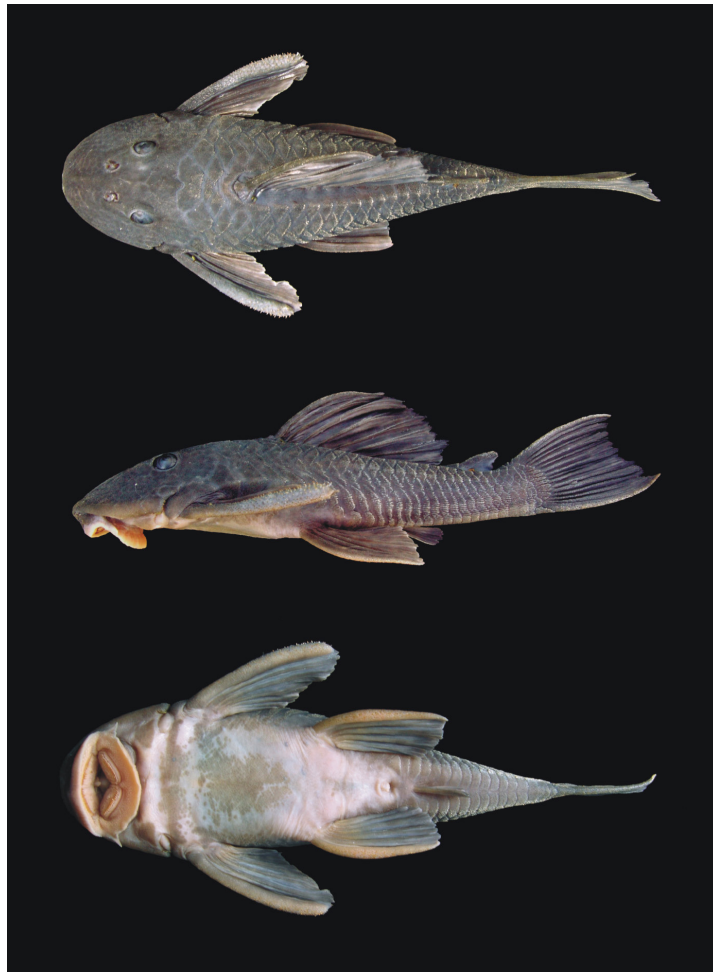
FIGURE 5 | Hypostomus robertsoni , holotype, NUP 22740, 127.9 mm SL; Brazil, Paraná State, Marialva, Keller River, tributary of Ivaí River, Upper Paraná River basin. Dorsal, lateral and ventral views.

than 46 on each premaxillary or dentary ( vs. more than 50); from H. agna , H. isbrueckeri , and H. luetkeni by having a single predorsal plate bordering parieto-supraoccipital ( vs. two to three plates in H. luetkeni and three in H. agna and H. isbrueckeri ); from H. guajupia by having conspicuous blotches or marks on body and fins ( vs. lacking conspicuous blotches or marks); from H. heraldoi by having pectoral-fin spine length smaller than pelvic-fin unbranched ray ( vs. larger than); from H. nigromaculatus by having pectoral-fin spine slightly curved, with diameter almost homogeneous along its length ( vs. curved club-shaped pectoral-fin spine); H. wuchereri by having abdomen plated in specimens about 100 mm SL ( vs. abdomen mostly naked in specimens up to 150 mm SL); from H. garmani and H. lima by having triangular-shaped caudal peduncle, its lateral surface straight ( vs. oval-shaped caudal peduncle, its lateral surface convex); from H. guajupia by having abdominal area mostly naked, larger specimens with transverse row of platelets in cleithral region and medially along abdomen ( vs. abdominal area densely plated, from pectoral girdle to anus); from H. hermanni by lacking or with inconspicuous dark (faded brown) blotches on body and fins ( vs. usually having conspicuous black blotches), and by having truncate caudal fin ( vs. emarginate).