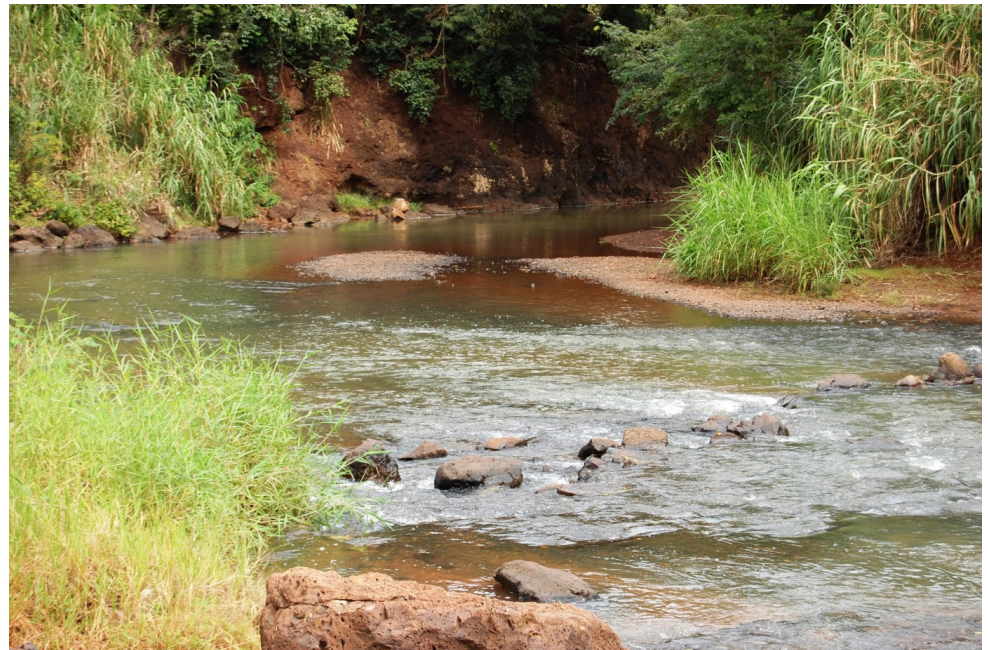
FIGURE 8 | Keller River, tributary of Ivaí River, Upper Paraná River basin. Brazil, Paraná State, Marialva. Type-locality of Hypostomus robertsoni .