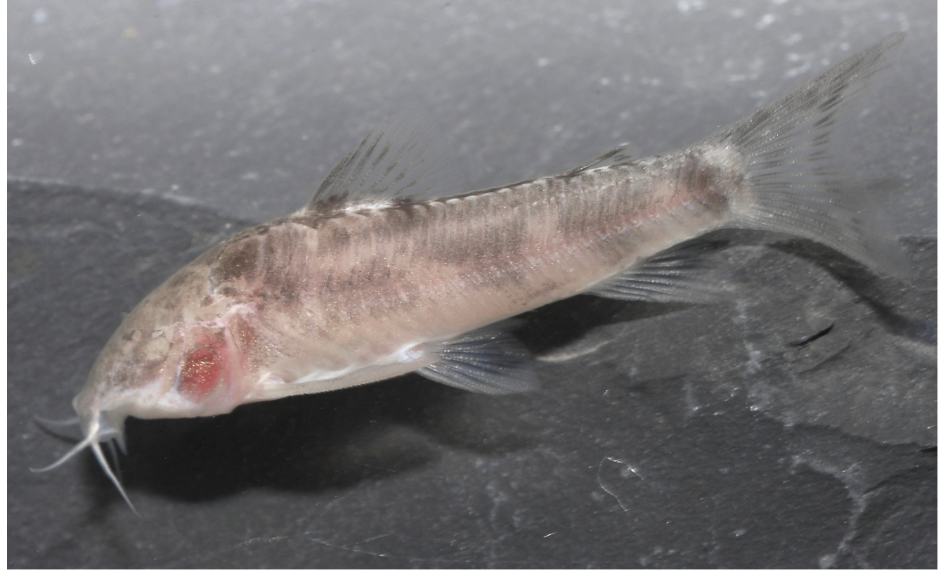
Fig. 1. Aspidoras albater, MZUSP 95905, about 25.0 mm SL, from Anésio III cave, Goiás, Brazil. Specimen kept in aquarium.

In laboratory, the catfish were kept collectively in an 801 aquarium, in the absence of light (except during maintenance activities and short, random periods of observation) and fed live Artemia crustaceans ad libitum , once or, less frequently, twice a week. These fish are quite tolerant to each other, sharing hiding places (limestone blocks); we did not observe agonistic interactions or other dominance behaviors. They behaved more actively than in the cave habitat, moving not only on the bottom but frequently also in midwater, occasionally surfacing to gulp air, apparently for neutral buoyance maintenance, as observed by Gee & Graham (1987) for many callichthyids. Epigean Aspidoras catfish from São Domingos karst area, also observed in laboratory, were active