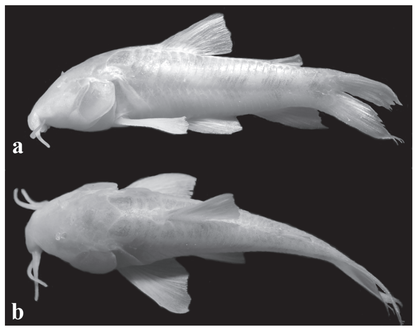
Fig. 2. Aspidoras albater, MZUSP 95905, 35.1 mm SL, from Anésio III cave, Goiás, Brazil. a) Lateral view; b) dorsal view.

predominantly near the bottom, using the midwater less frequently than the cave specimens. The latter are very agile, jumping over barriers above the water surface and trying to climb water currents in the aquarium. All individuals promptly accepted live Artemia offered in laboratory, intensifying the midwater activity on such occasions.