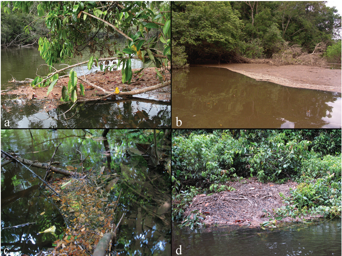
Fig. 1. Floating litter banks of different dimensions and means of accumulation ( i.e. , diverse retention mechanisms): (a) floating litter banks retained by branches of riparian vegetation; (b) a large floating litter bank retained in a “ria lake” condition at the confluence of the Aliança Stream with the Branco River; (c) a small floating litter bank close to the margin of a 4 th -order stream in the Urubu River basin; and (d) a large floating litter bank almost completely out of the water in a stream in the Urubu River basin during the dry season.

Despite their putative temporal instability, such habitats are colonized by a variety of benthic, pelagic and nektonic organisms and were given the name “kinon” by Fittkau (1977). This author described the fauna of a kinon to be mostly aquatic macroinvertebrates and fungi and