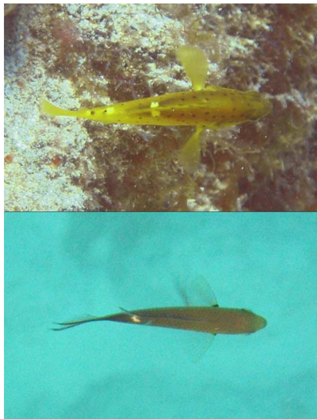
Fig. 2. Juvenile coney (above) and brown chromis (below) in dorsal view showing pale yellow spots on dorsum.

Yellowish juvenile coney may be regarded as a good example of aggressive mimicry (reviews in Sazima, 2002; Randall, in press) similar to that of juvenile tiger grouper, Mycteroperca tigris , whose model is the schooling and plankton-picking bluehead wrasse, Thalassoma bifasciatum (Labridae) in the Caribbean (Snyder, 1999; DeLoach, 1999). As in the case of juvenile coney, the tiger grouper was recorded successfully preying on smaller fishes while amidst its model's schools (Snyder, 1999). Both groupers fit the facultative mimicry relationship as defined by Russell et al. (1976).