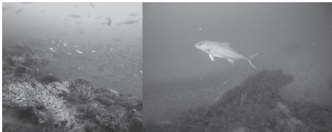
Fig. 1. A school of blue runner Caranx crysos (top left) and group of greater amberjack Seriola dumerili (right, one visible in photograph) drive prey fishes down to ledge habitat during predation events.

We computed Bray-Curtis similarity coefficients for all species pairs from 17 mixed species groups of piscivorous fishes observed during dives. This procedure provided a method of quantifying the similarity of species occurrences within sets of observations (Clarke & Gorley, 2001) with similarity values serving here as indices of the strengths of behavioral relationships between the occurrences of species pairs (Table 2). Sphyraena barracuda , Seriola dumerili and Scomberomorus maculatus all have high pair-wise similarity indices indicating common co-occurrences in foraging groups. Seriola rivoliana and S. dumerili have a moderate similarity index value but it is lower than the other taxa listed above. The similarity index value between C. striata - C.