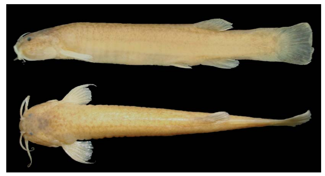
Fig. 2. Ituglanis mambai , holotype, MCP 42538, 53.4 mm SL. Lapa do Sumidouro Cave, Posse, Goiás, Brazil. Lateral (above) and dorsal (below) views.

oxygen, 7.4 mg.l<sup>-1</sup>. All observed individuals were solitary, with swimming activity on the bottom and sometimes in the midwater. In the natural habitat, I. mambai catfish displayed cryptobiotic habits, trying to hide into the gravels and under boulders when disturbed, apparently showing a negative response to carbide and flashlight. It was observed a preference to slow-moving pools. Recent flood marks were observed