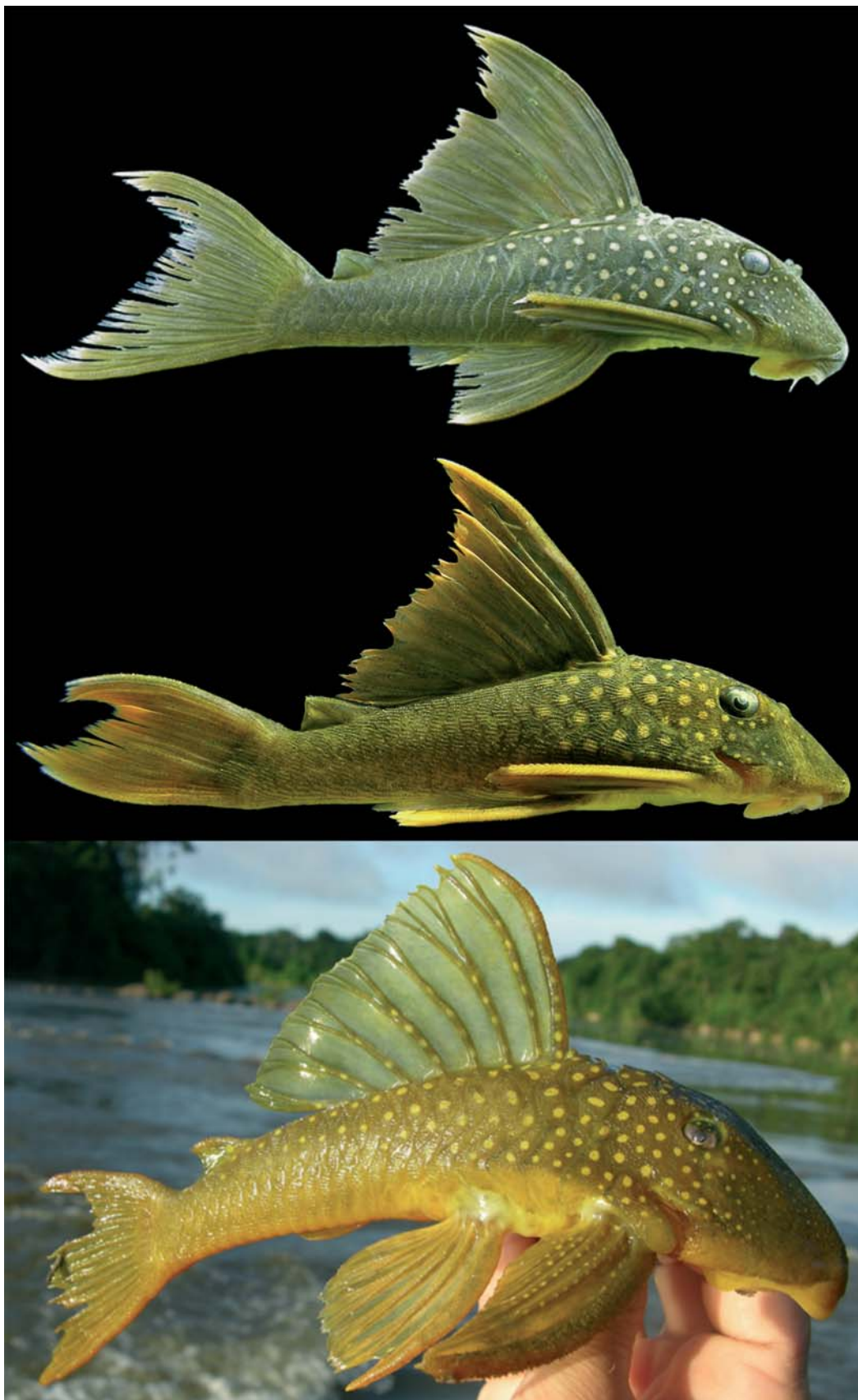
Fig. 1. Live specimens of a: Baryancistrus demantoides , adult, AUM 42034, paratype, 96.3 mm SL; b: B. demantoides , juvenile, MCNG 54031, paratype, 54.1 mm SL; c: Hemiancistrus subviridis , AUM 42933, 146.9 mm SL.