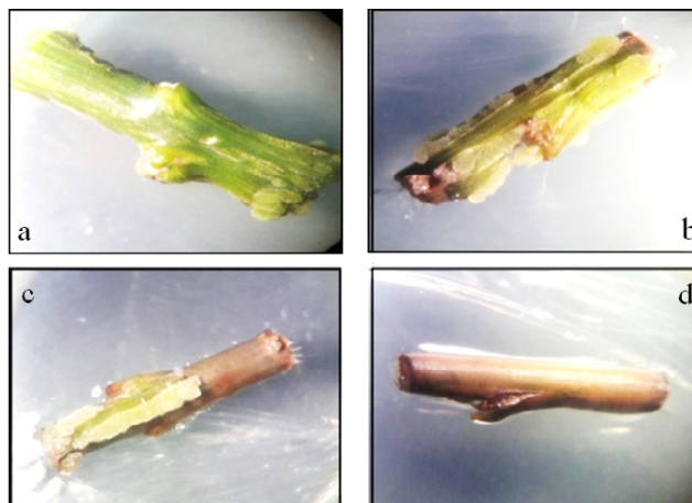
Figure 1. Browning ranking of nodal explants in S. junceum : (a) degree 0: no brown signs, (b) degree 1: partial browning at the cut end, (c) level 2: browning at the cut end and bottom surface of the explant, (d) level 5: Browning the whole surface of the explant