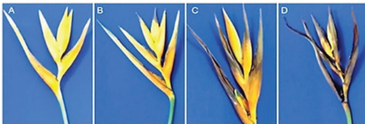
Figure 1. Senescence process of flower stems of Heliconia psittacorum . (A) score 4, (B) score 3, (C) score 2, (D) score 1 (discard).

Score 4: inflorescence with natural gloss and absence of dark spots on the bract apex (Figure 1A); Score 3: inflorescences with natural gloss and onset of senescence (dark spots) on the bract apex (Figure 1B); Score 2: inflorescences without natural gloss, dark spots larger than 5.0 cm below the bract apex or slightly stained bracts (Figure 1C); Score 1: inflorescence without natural gloss and bracts with intense dark spots (Figure 1D).