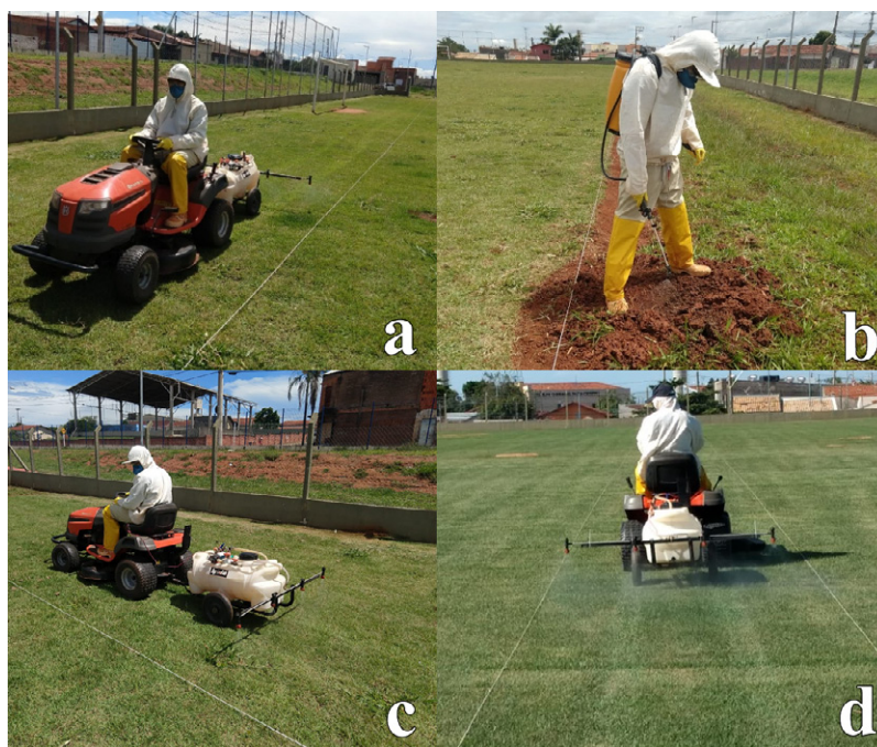
Figure 3. Spraying of the field to control weeds with a sprayer attached to the tractor (a, c, d) and pests backpack sprayer (b)

2b). For the control of anthills, a spray was applied twice across the total area, at 10-day intervals, using the sprayer and tractor described above.