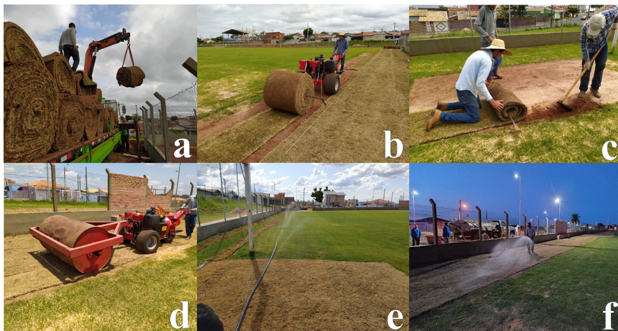
Figure 7. a) Munck crane unloading rolls of sod; b) planting the turfgrass on the field perimeter; c) planting the sod in the goal area; d) compacting with a roller; e) irrigation with garden sprinklers attached to a hose; f) manual irrigation with water from an irrigation truck.

In each of these areas, fertilization was conducted before planting to improve the development of turfgrass and to stimulate the root system. A commercial fertilizer 4-14-8 was used, following the recommendation of Santos and Castilho (2018a) of 60 \text{ g m}^{-2} for emerald grass.