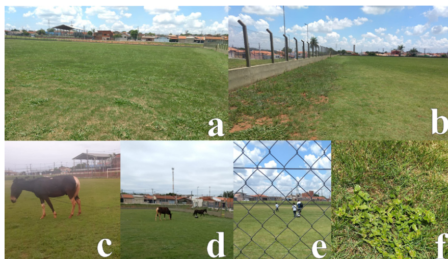
Figure 1. Field conditions before starting the revitalization. a) view of the field contaminated with weeds; b) perimeter area without turfgrass and contaminated with weeds; c - d) grazing horses; e) pedestrian traffic across the field; f) detail of weeds in the field.

The soccer field is planted with emerald grass and has in a total area of 9,296 m 2 (83 x 112 m) (game area + perimeter with players' rest area). The field is located within a recreational park in the city and is surrounded by a fence; however, its gates remain open for anyone who wishes to enter. Thus, the field experiences heavy pedestrian traffic (Figure 1e), many children play in the field, and animals are allowed to graze on the grass (Figures 1c and d).