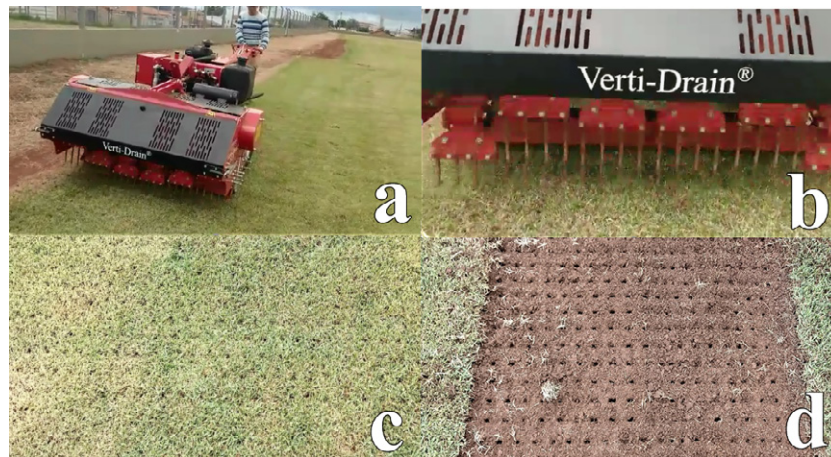
Figure 4. a) equipment for aerating the soil; b) detail of the Verti-Drain® attachment that perforates the soil; c) perforations after aeration of turfgrass; d) perforations after aerating in exposed soil.

This procedure also helps to remove fine particles from the soil surface layer, modify the profile in fields built on clay soils, and control the thatch, which is an organic layer that forms below the carpet and prevents water penetration (Campanelli, 2003; Connebol, 2019). As such, it creates holes across the field that can be filled by sandy materials, such as the medium sand that was applied in the subsequent procedure.