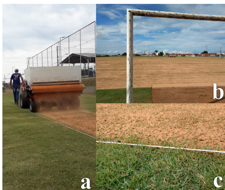
Figure 6. Application of sand in the field. a) instrument used to apply sand; b) detail of the field area where sand was applied; c) detail of turfgrass with and without sand.

application, the field was brushed with a metallic structure to spread the sand evenly over the field and allow it to enter the holes and adjust the micro-leveling without damaging the lawn.