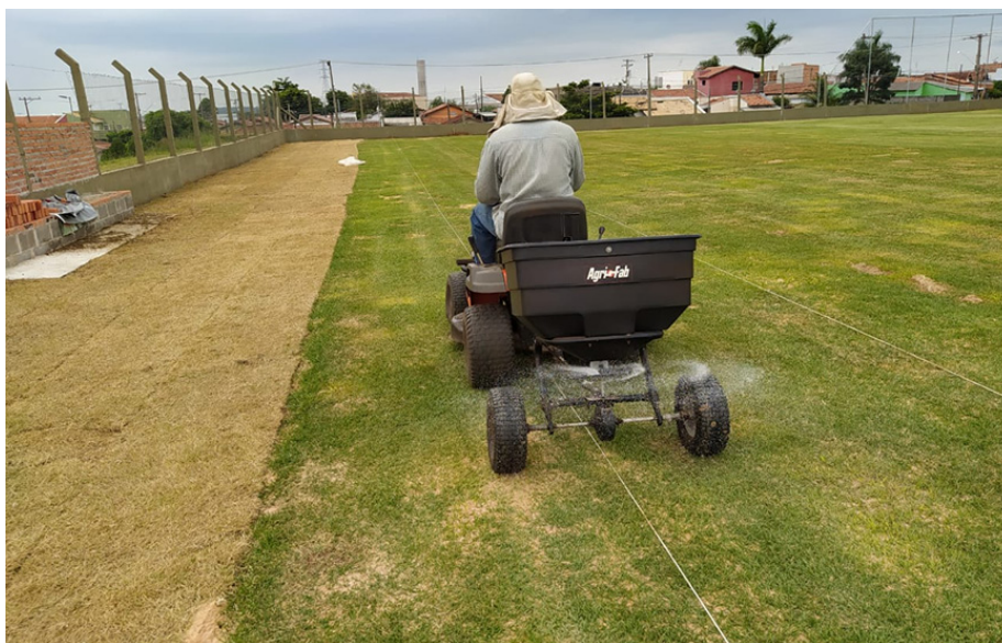
Figure 8. Maintenance fertilizer with ammonium sulfate in the field.