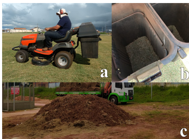
Figure 2. a) Rotary blade mowing tractor; b) clippings collector coupled to the tractor; c) volume of clippings discarded after cutting.

followed Melo's recommendations (2016) who suggests that in a process of revitalizing sports fields, a first short cut of the grass is required to standardize the area and locate possible imperfections. These defects can include holes and scalping, which are areas where turfgrass has grown excessively and shaded the lower part of the turf, after cutting they look white/yellowish (Aldahir, 2012; Aldahir, 2015; Conmebol, 2019). All mowing was conducted using a Husqvarna® LT 1597 tractor (Figure 2a) with its own collector (Figure 2b) and two rotary mower blades that can cut an area of up to 1.5 m in width with each pass. The tractor was maintained in gear 3, at an accelerated speed.