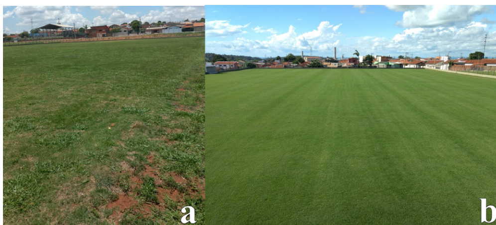
Figure 9. a) field before revitalization; b) field after revitalization

Thus, adopting practices and measures used in professional fields for this amateur field, it was possible to provide the qualities necessary to ensure an excellent soccer match. However, the consistent application of maintenance procedures must be adopted, including correct nutritional management and pest, disease, and invasive plant control. Meanwhile, the intensity of games must be balanced to avoid extensive wear on the turfgrass.