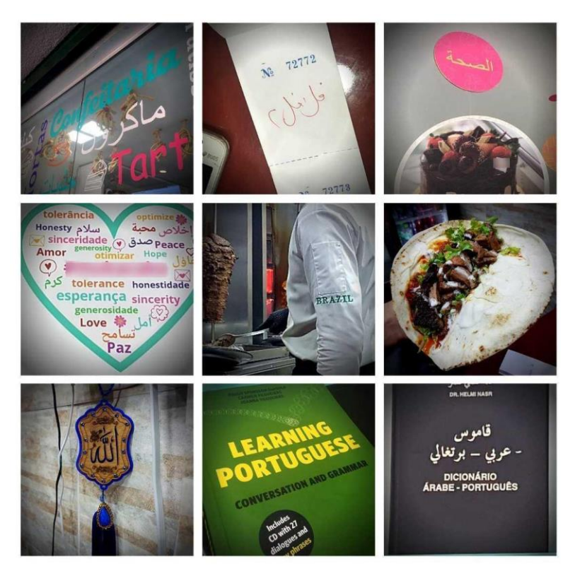
Figure 2. Ethnic elements in the enterprises of the Syrian refugees

At the snack bar, arrival is marked by the sound of typical Arabic music and by the store front with photographs of Arabic products. On more careful inspection, it is perceived that it says kibe frtio , with a typing error in the second word, easy to see for a native, but not for a foreigner. It is possible to see the vertical meat and chicken skewers being prepared by the uniformed workers, one of them with Brazil, written in English, sewn on the sleeve of his dolman. On the orders, the words are written in Arabic (field diary, 05/24/2019). Figure 2 presents photographic records of some of these elements that relate to the immaterial labor through the maintenance of the language of origin in the different activities of the restaurant, to the reinforcement of the ethnicity of the enterprise through the sensorial and visual elements, to the mixture of the culture of origin with the culture of the destination country, and to the effort to learn Portuguese to capitalize on the work.