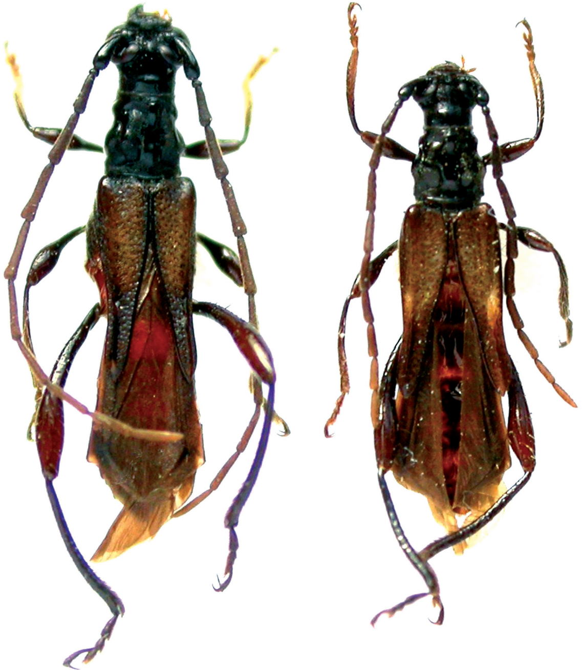
FIGURE 1: Oxyloposebus brachypterus sp. nov., paratypes: ♂, 8.1 mm (left), ♀ 7,7 mm (right).

the longest, greatly enlarged and strengthened, especially in female, not quite reaching apex of abdomen. Tibiae curved, lacking carina nor sulcate; protibia only slightly curved, slightly widening before apex, apex with small, inconspicuous mesal spine; mesotibia strongly curved, gradually widened to apex, apex with two small spines, the lateral one indistinct; metatibia distinctly curved, apex with two spines, the lateral one