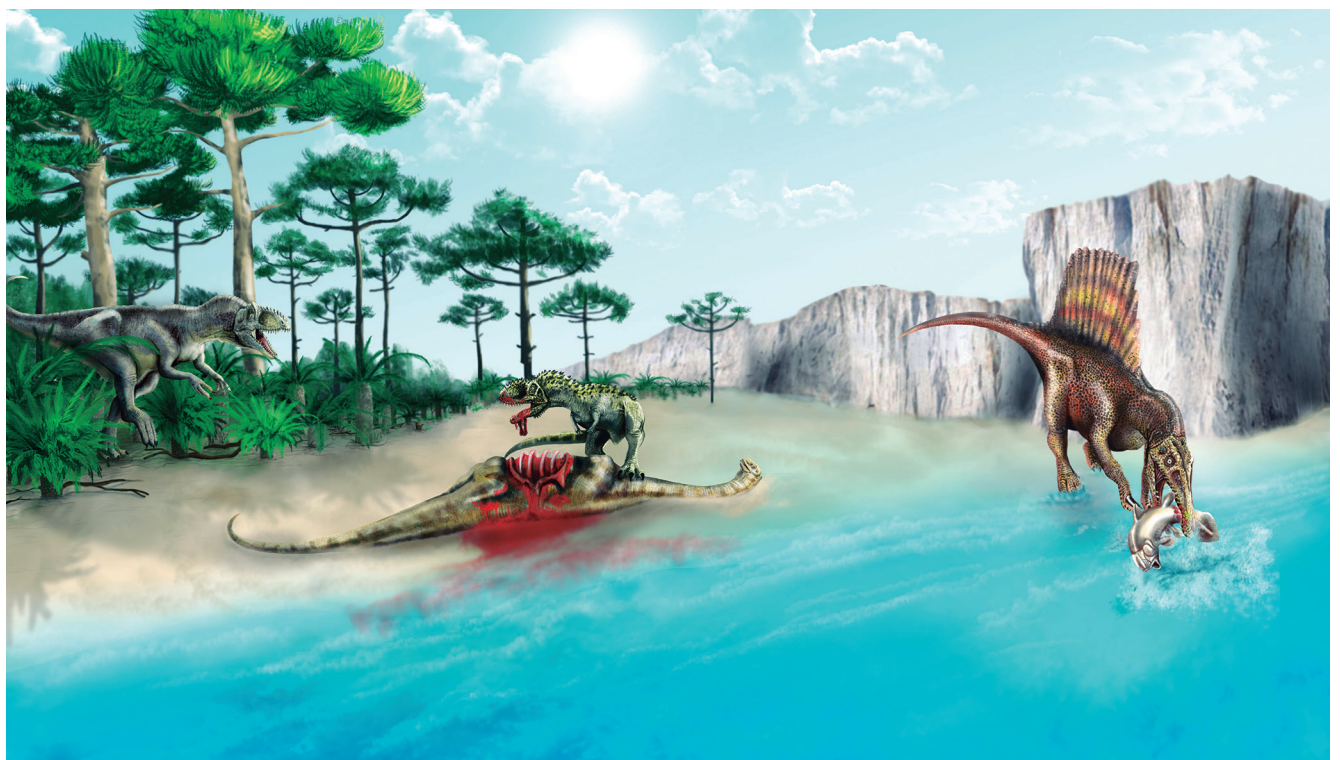
Figure 3. Paleoenvironmental reconstruction of large theropods from middle Cretaceous North Africa showing carcharodontosaurid (left), abelisaurid (middle) and spinosaurid theropod (right) feeding. Drawing made by L. Vidal.