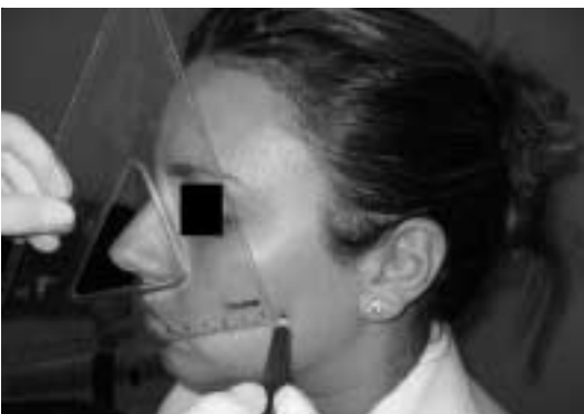
FIGURE 3. Localization of the buccinator muscles point.