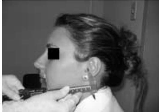
FIGURE 2. Prominence of the nasogenal sulcus to the tragus measurement.