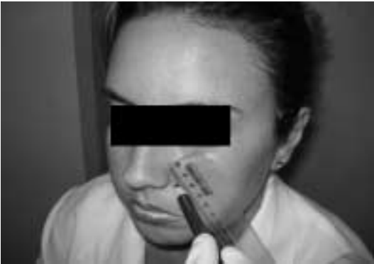
FIGURE 1. Prominence of the nasogenal sulcus measurement.