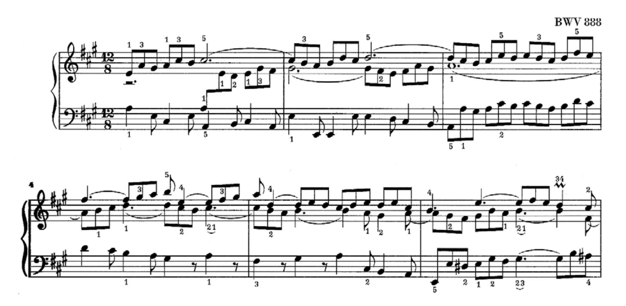
Figure 5: Prelude in A major, WCT II, mm. 1-6. This prelude is giga I-like.

Another gigue is the Prelude in A major, Book 2 . This one fits in the category of giga I, with consistent triple groupings throughout the piece and imitative counterpoint as texture. The 12/8 time signature and the key of F major suggests a moderate tempo and an atmosphere (affect) of constancy and generosity (SCHUBART, 1806).