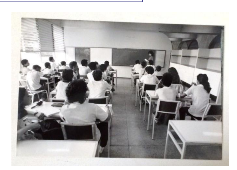
Figure 2 – CIEP classroom

The standardization of the two-student desk was supposed to promote the increase of sociability and value work group as one of the marks of active pedagogies in CIEPs. However, students appropriate themselves of the spaces based on previous experiences and teachers also brought with them previous knowledge on how to teach and learn in a school environment.