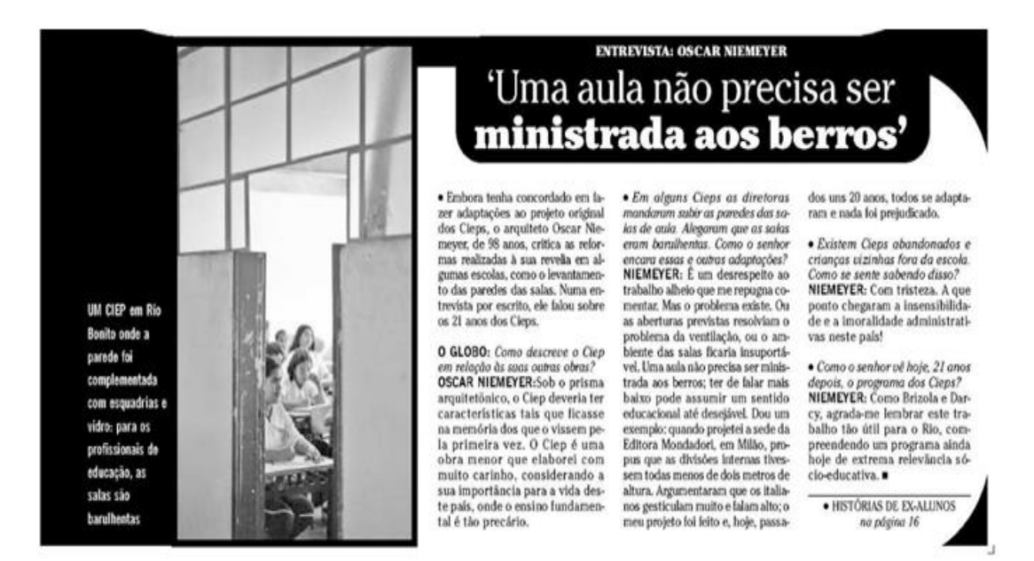
Figure 1-Oscar Niemeyer's interview to newspaper O Globo , with the title "A class does not need to be shouted"

We can see that the educational issue of the voice was one mark that articulated architecture and the behavior in school space.